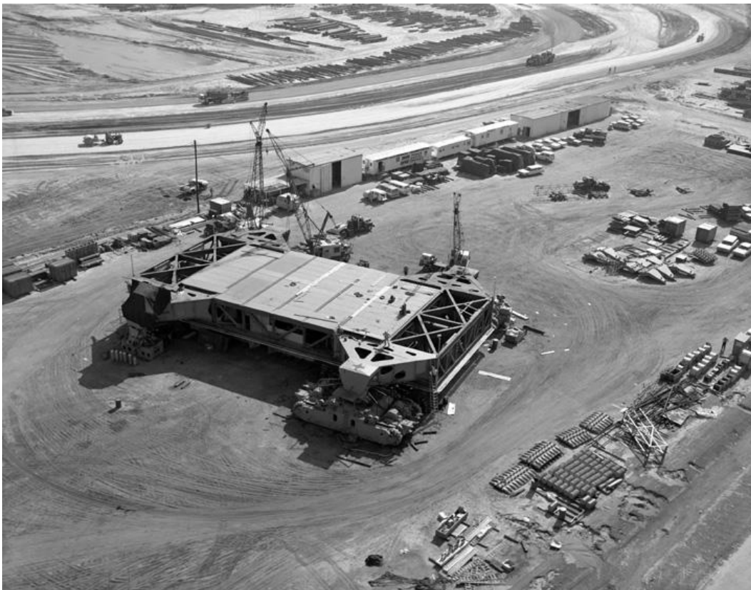
Figure A-2. Construction of Crawler Transporter 1 at KSC, November 9, 1964.