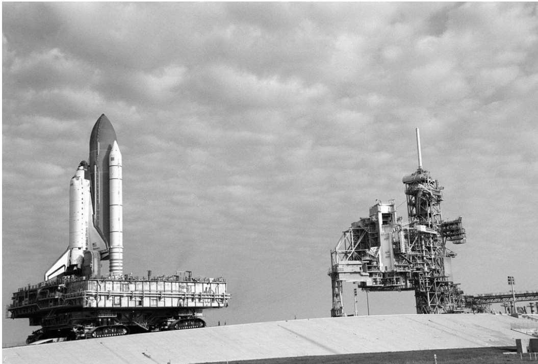
Figure A-8. Crawler Transporter carrying Space Shuttle Discovery up the five percent incline at Launch Pad 39B, May 20, 1999.