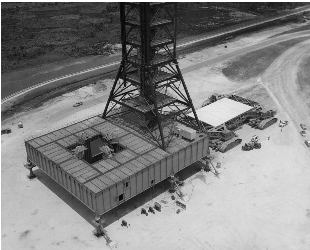
Figure A-3. Crawler Transporter 1 moving underneath Mobile Launcher 3, May 20, 1965.