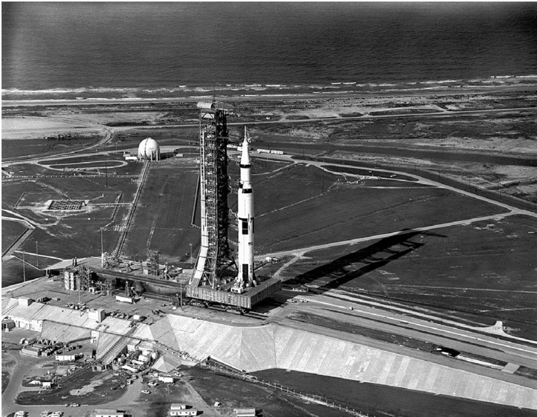
Figure A-4. Apollo 11 approaching Launch Pad 39A atop Crawler, May 20, 1969.