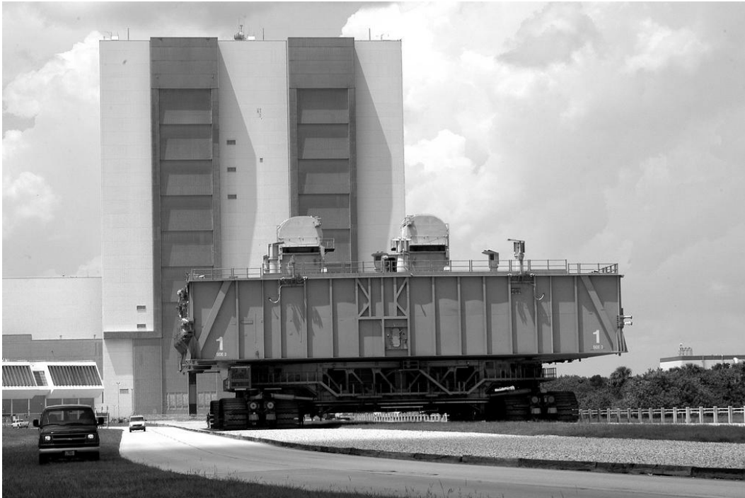
Figure A-6. Crawler Transporter moving a Mobile Launcher Platform, August 18, 2003.