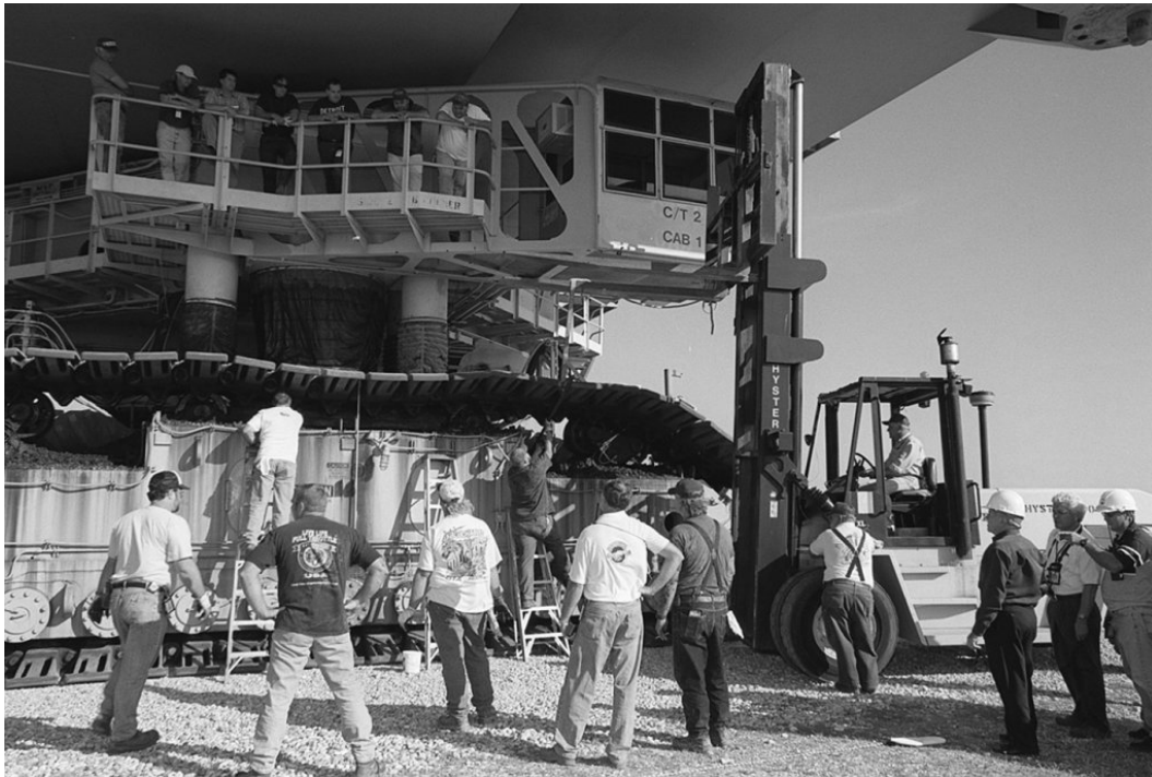
Figure A-9. Workers preparing to remove a broken shoe from a Crawler, October 31, 2000.