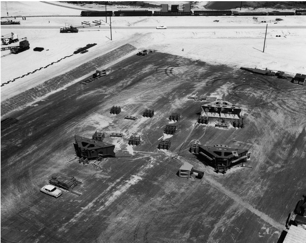
Figure A-1. Aerial showing initial layout of Crawler Transporter 1 components at KSC, May 11, 1964.