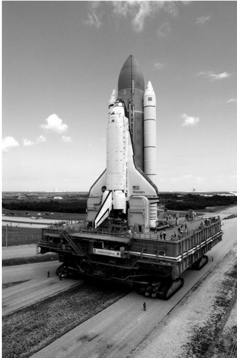
Figure A-7. Crawler Transporter carrying Space Shuttle Discovery to Launch Pad 39B, April 6, 2005.