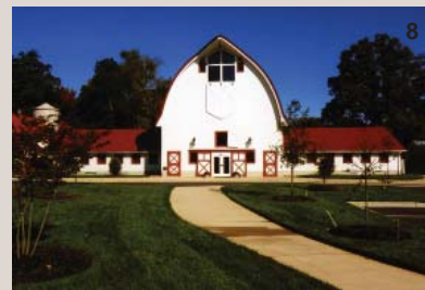
1. Merced Theater, Merced, CA ; 2. Portland Fire Station, Portland, OR ; 3. Babcock Theater, Billings, MT ; 4. ASM International Headquarters, Materials Park, OH ; 5. Carson Pirie Scott Building, Chicago, IL ; 6. Mason City Bank, Mason City, IA ; 7. Ottawa Street Power Station, Lansing, MI ; 8. Win-Mock Barns, Bermuda Run, NC.