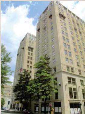
The John Marshall Hotel, Richmond, VA