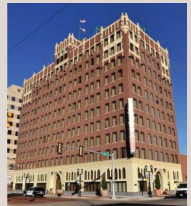
The Fisk Medical Arts Building, Amarillo, TX

Located in the panhandle of Texas, Amarillo regarded a downtown hotel to be important to their greater redevelopment efforts for the city. After years of service, the 1927 Fisk Medical Arts Building was in need of updating; rents were not even offsetting the building operation. Put up for sale, it was acquired in 2008 by a Dallas, Texas company, Newcrest Hotels, and rehabilitated at a cost of nearly $12 million for use as a Courtyard by Marriott Hotel. It received National Park Service tax credit certification in 2012. This project represented the largest private investment in the city's central business district in 40 years and provided for a much needed hotel with 107 rooms. Besides new jobs and benefiting the downtown revitalization, the hotel property at a local taxable value of $5.4 million has increased the tax base.