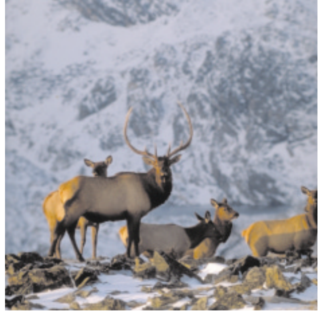
FOR THE LEWIS & CLARK BICENTENNIAL AND OTHER TRIBAL OPPORTUNITIES