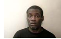
Felony arrest Nov. 28