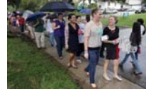
Michelle Obama at FSU