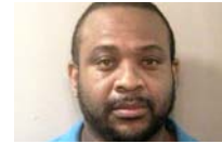
Felony arrest Feb. 6