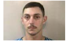
Felony arrest Jan. 30