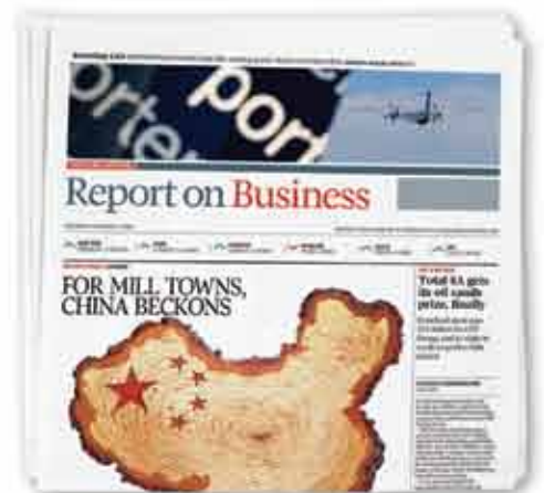
ENGAGING new story formats and a unique experience on Saturdays.