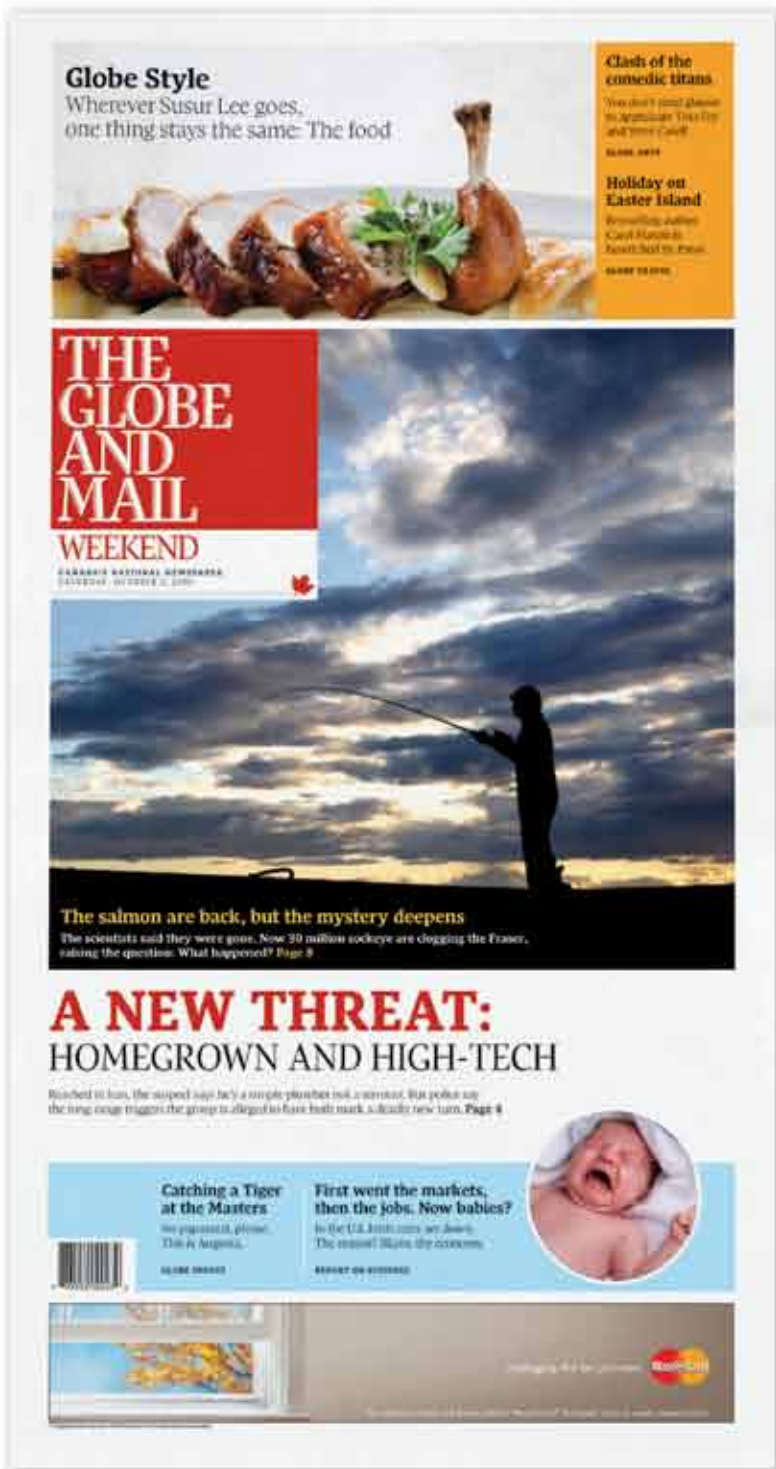
REDESIGNED with a new convenient size.