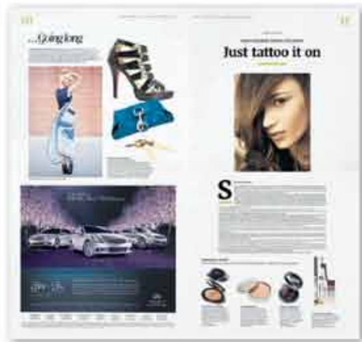
COLOUR on every page.

After years in the making — The Globe and Mail is immensely proud to be the first newspaper in Canada that brings this unparalleled print and digital experience to our readers and advertisers.