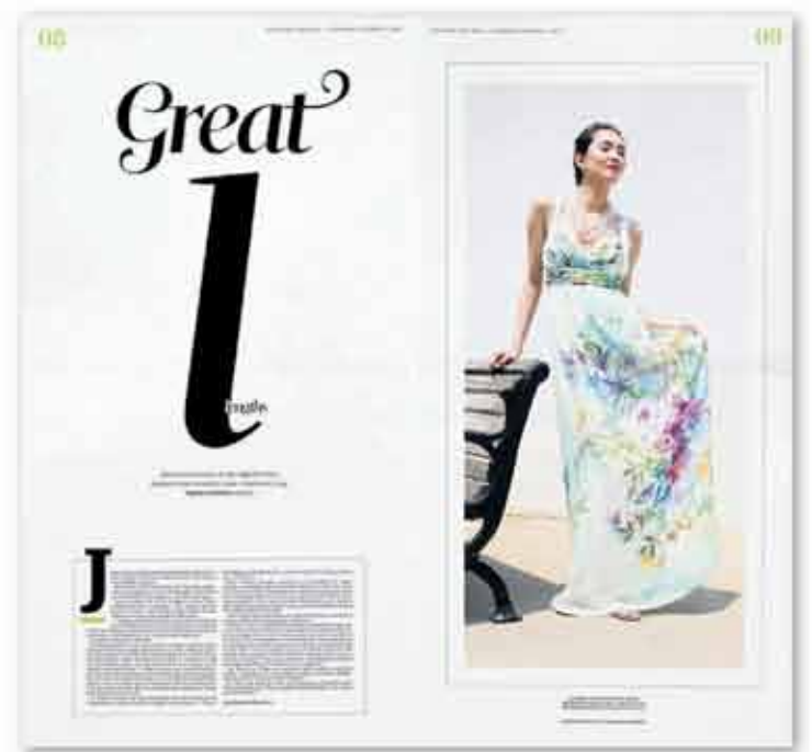
BRIGHTER stock options and custom formats.

DIGITAL enhancements now offer endless possibilities across multiple platforms.