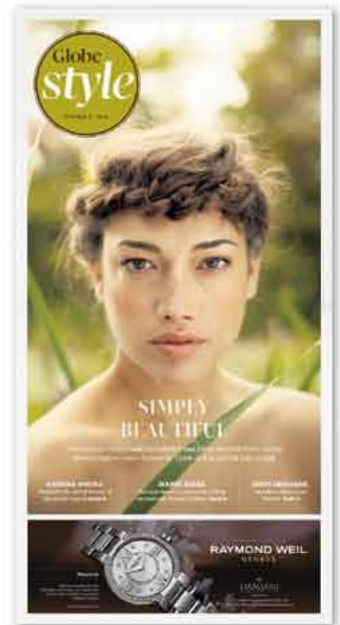
UNPARALLELED reproduction quality.