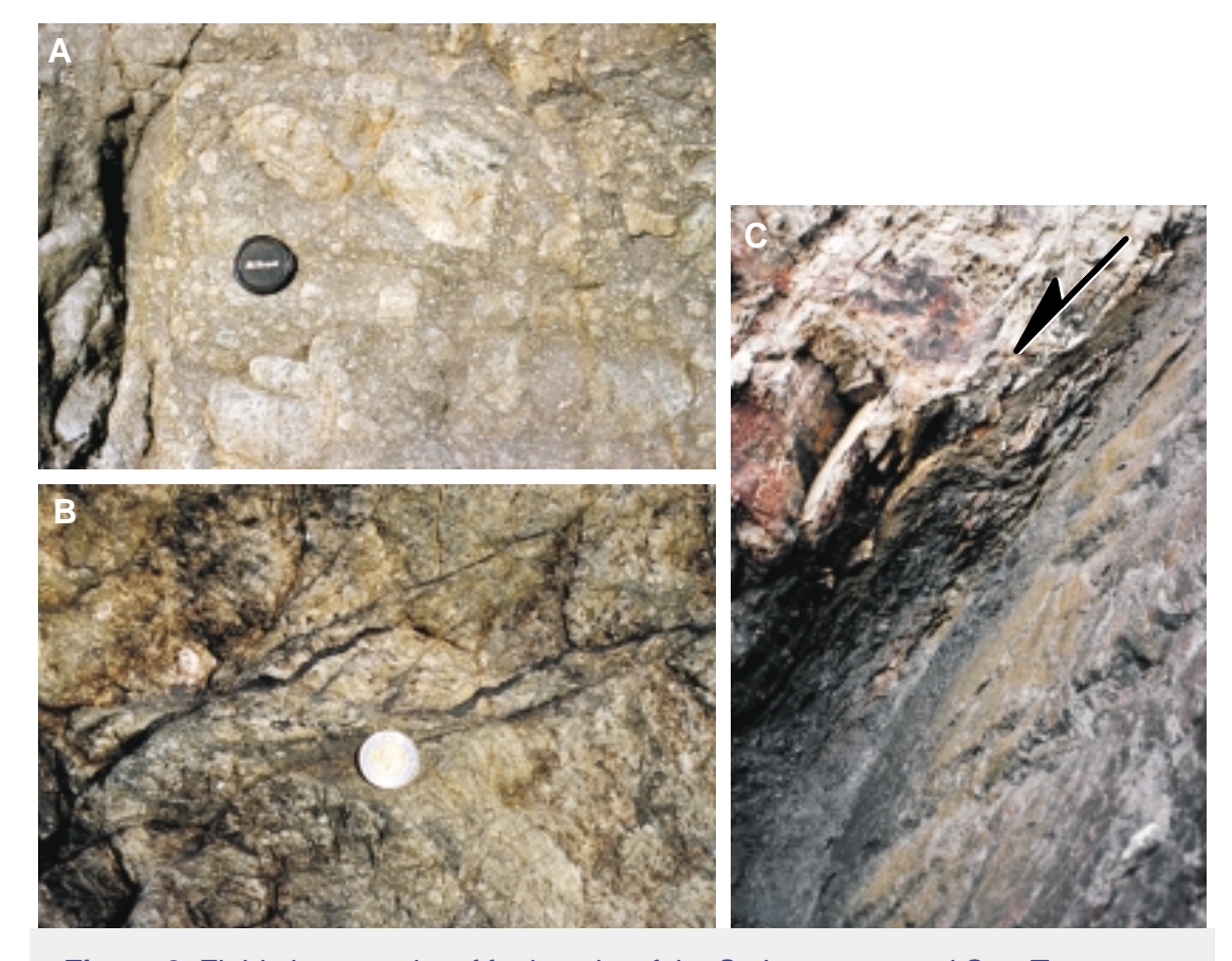
Figure 3. Field photographs of fault rocks of the St. Lawrence and Cap-Tourmente faults. A) Fault breccia of basement rocks along the St. Lawrence Fault at Sault-au-Cochon. B) Veinlets of dark-coloured pseudotachylyte in highly fractured basement rocks at Sault-au-Cochon. C) Foliated gouge of the St. Lawrence Fault at Sault-au-Cochon. Vertical view toward the southwest. Note nascent shear bands indicating normal-sense faulting.