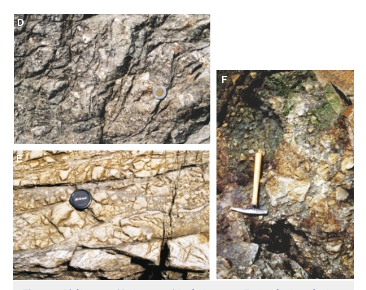
Figure 3. D) Close-up of fault gouge of the St. Lawrence Fault at Sault-au-Cochon. Note the faintly developed fault fabric. E) Fault breccia of the Cap-Tourmente Fault. F) Fault breccia with a composite matrix of crush breccia and pseudotachylyte (dark-coloured material) at Cap-Tourmente.