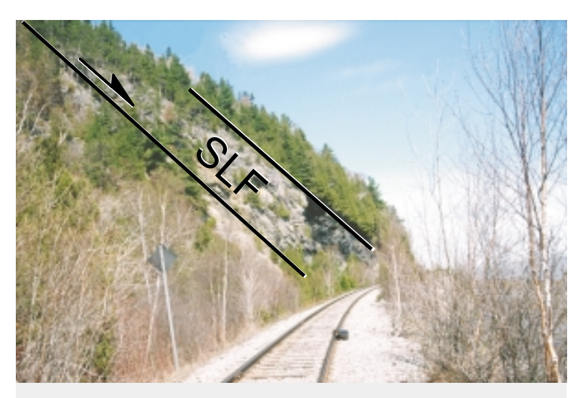
Figure 2. Panoramic view of the St. Lawrence Fault (SLF) at Sault-au-Cochon. Fault breccia and cataclasite are exposed along the shoreline at the base of the cliff. View toward the northeast.