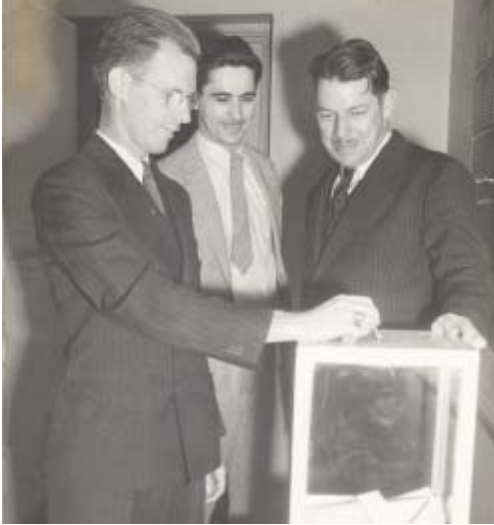
Greenbelt's original residents exercise their right to vote during early City Council elections.

When Greenbelt's first families moved in, the federal government provided rules on how the city would be operated. There was no local government in place to provide local services and laws. Within six weeks, the people held their first election, choosing a five member City Council from among 17 candidates establishing the first Council-Manager form of government in the state.