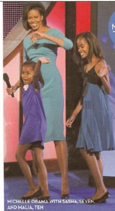
MICHELLE OBAMA WITH SASHA, SEVEN, AND MALIA, TEN