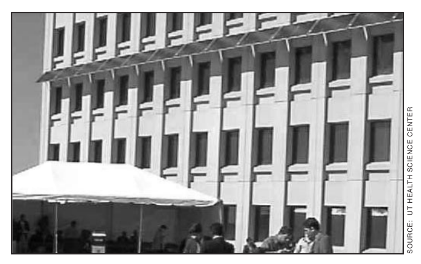
Building integrated PV panels The University of Texas Health Science Center in Houston incorporates a wall mounted awning to provide shade for windows below it as well as 7kW of AC modules.

While there are a myriad of lowpower applications suitable for PV use, the biggest market for PV power may lie on residential rooftops. As always, the first step would be to make your home as energy efficient as possible. Your remaining electrical needs would then require a PV system with a capacity of about two kilowatts. With a price tag of $5,000 to $20,000, a complete residential PV system offers a green alternative that may appeal to some grid-connected consumers. Perhaps more importantly, the PV option allows homeowners greater flexibility in choosing a home site, since self-sufficient PV homes would not need to be located near existing power lines.