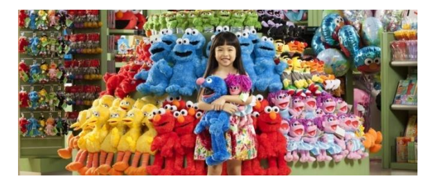
Shop to your heart's content with a wide-range of Sesame Street merchandise at two specially-themed retail outlets and a Sesame Street School Bus in Universal Studios Singapore.