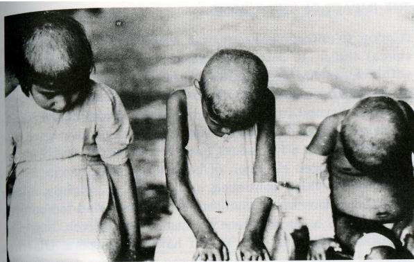
Plate 27. Loss of hair seen in girls ( left and middle ) and a boy ( right ), Nagasaki.

Above pictures are from “The impact of A-Bomb” in 1985. These pictures illustrate the atomic bomb syndromes. Because virtually no medicine was available immediately after the bombing, Dr. Akizuki fed his patients the traditional Japanese food mentioned such as brown rice, miso and vegetables. Since the hospital was luckily used as a storage center for miso, soy sauce, and seaweed, as well as brown rice of that communal area, the hospital staff could supply their patients with traditional food. As a result, he was able to help many people survive from the direct injury, while other survivors perished or suffered from severe radiation sickness. He believed in the radiation-controlling effects of miso and claimed that the reason the people at his hospital survived radiation sickness was because of the miso soup that they ate every morning (Akizuki 1981 & 1975). When I interviewed the survivors at his hospital, they were unsure at first, but when I mentioned his claim regarding the hospital diet, most of them strongly agreed with his claim.