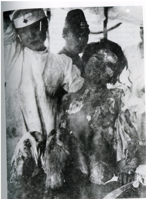
Plate 12. A fourteen-year-old girl with whole body burns. At the relief station in Omura Naval Hospital. Around 10 August 1945.