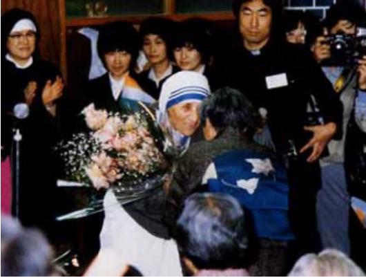
April, 1982 Mother Theresa