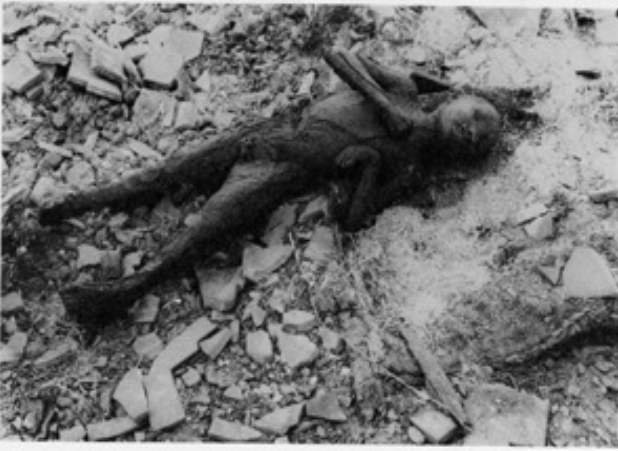
Iwakawa township, Nagasaki (700 m south-southeast of ground zero). The charred body of a volunteer student worker lies in the road where he was walking. 10 August 1945.