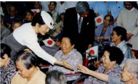
July, 1995 The Emperor and Empress (A Memorial Visit)

The following are the summaries of their atomic bomb experiences, focusing on their diet, especially the intake of miso.