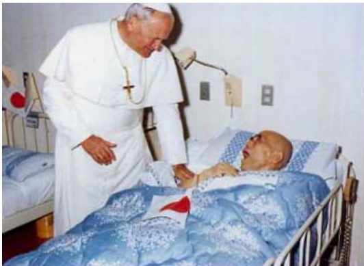
February, 1981 Pope John Paul II

[Pictures of Pope, Mother Theresa and Emperor, visiting the nursing home]