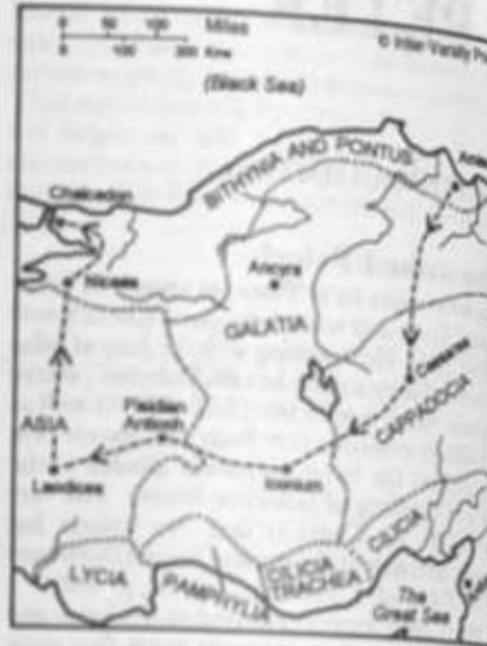
Suggested route taken by the bearer of Peter's first letter from Amisus to Chalcedon.

The social status of the recipients probably reflected that of most of the churches of the day, as a cross-section of the community. There