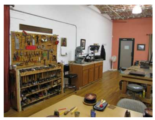
Valentin Yotkov Studio Brooklyn, New York

I invite you to pay an imaginary visit to the chaser's studio . There we see a small but sturdy table, usually 29" to 31"in height. The table is close to the window as defused sunlight is best for chasing on non ferrous metals. On the table is an 8" diameter cast iron bowl over a round rubber pad. The bowl is filled with Red German pitch and positioned over one of the table's legs to avoid vibrations during chasing. A beautiful set of chasing tools is placed face up in a simple can and beside it — a couple of chasing hammers. At the far end