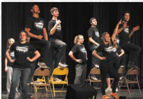
Members of TMP Singers practice a musical number for their annual dinner show.

TMP Singers is a select show choir that is active throughout the school year. Members are selected by audition. A