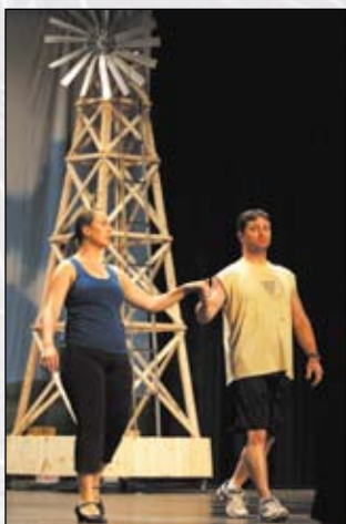
Hays Community Theatre members rehearse a scene from "Oklahoma."

Hays Community Theatre is a community-centered organization designed to challenge and inspire individuals of all ages and backgrounds to share talents and abilities through theatrical production. The group's goals are to provide opportunities to perform and share talent; promote community; and present quality entertainment.