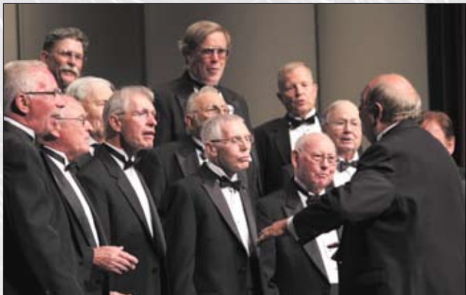
The High Plains Barbershop Chorus performs during a Hays Symphony Orchestra concert.