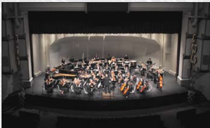
The Hays Symphony Orchestra performs during the 100th anniversary season at Beach/Schmidt Performing Arts Center.