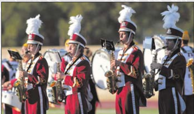
The Hays High marching band performs during halftime of a football game.