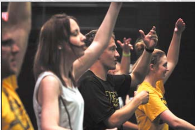
Fort Hays State University students rehearse for an upcoming musical production.