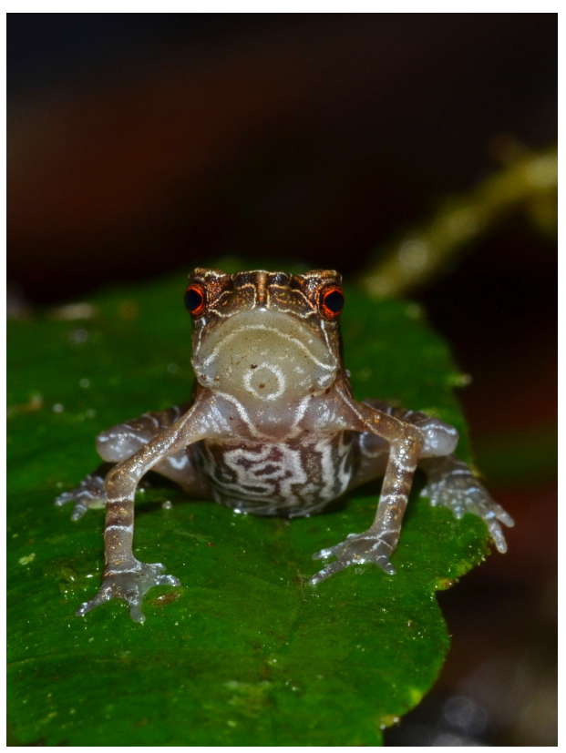
Fig. 4. Ventral pattern of froglets of Andinophryne olallai . Manduriacu, Imbabura Province, Ecuador.

ence is that dorsal and flank coloration is not uniform in all individuals; the head and dorsum were darker brown than the light brown-tan flanks in most live animals observed at Manduriacu.