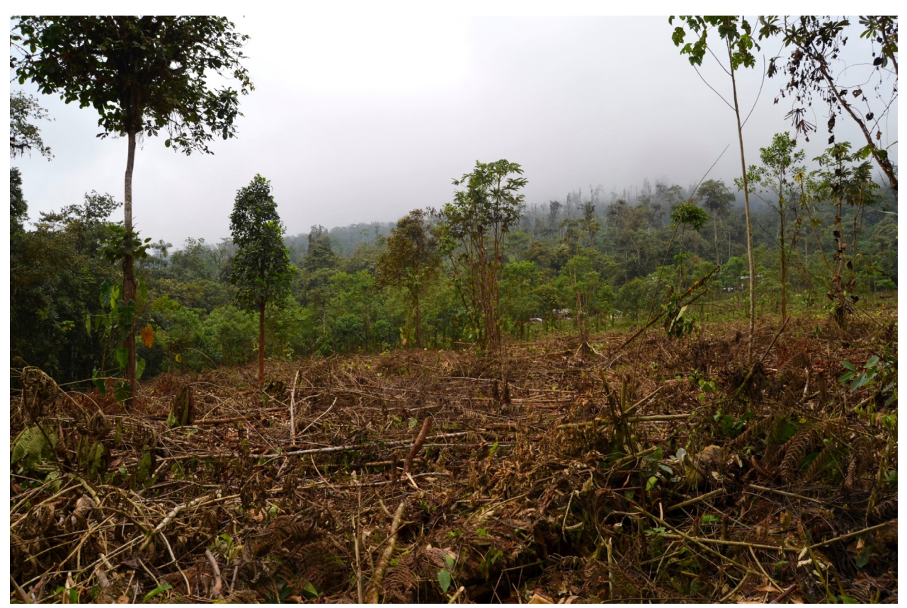
Fig. 5. A recently deforested plot of land that is less than one km from the population of Andinophryne olallai in Manduriacu, Imbabura Province, Ecuador.

Andinophryne olallai is currently classified as Data Deficient by the IUCN Red List (Coloma et al. 2010). However, more recent assessments considers A. olallai as Endangered based on its restricted range, the apparent extirpation of the species from the type locality and