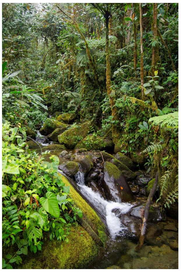
Fig. 2. Andinophryne olallai habitat from Río Manduriacu, Imbabura Province, Ecuador. All individuals encountered were found perched on branches or leaves along streams similar to the stream pictured here.

All information on A. olallai reported by Hoogmoed (1985) was based on two adult specimens. Our observations of froglets and juveniles mark the first reported information on the species' pre-adult morphology and ontogeny. Ontogenetic change in color pattern is considerable (Fig. 3), and is one of the few reported cases of such an extreme change in bufonids in Ecuador (see Hoffman and Blouin 2000). We observed a total of two froglets (mean SVL 13.1 mm) and five juveniles (mean SVL 26.6 mm). Froglets have a copper, gold, and white dorsum with a mottling pattern reminiscent of some species of Atelopus (Fig. 3: A, B). This contrasts with the patternless brown dorsum of the adults. The venter of froglets have a series of white undulating lines that extend the length of the body (Fig. 4). The iris in froglets and juveniles is more vibrantly red than in adults, which have a yellow copper-colored iris that is darker medially near the horizontally oval pupil. Froglets also differ from adults in lacking tubercles and parotoid