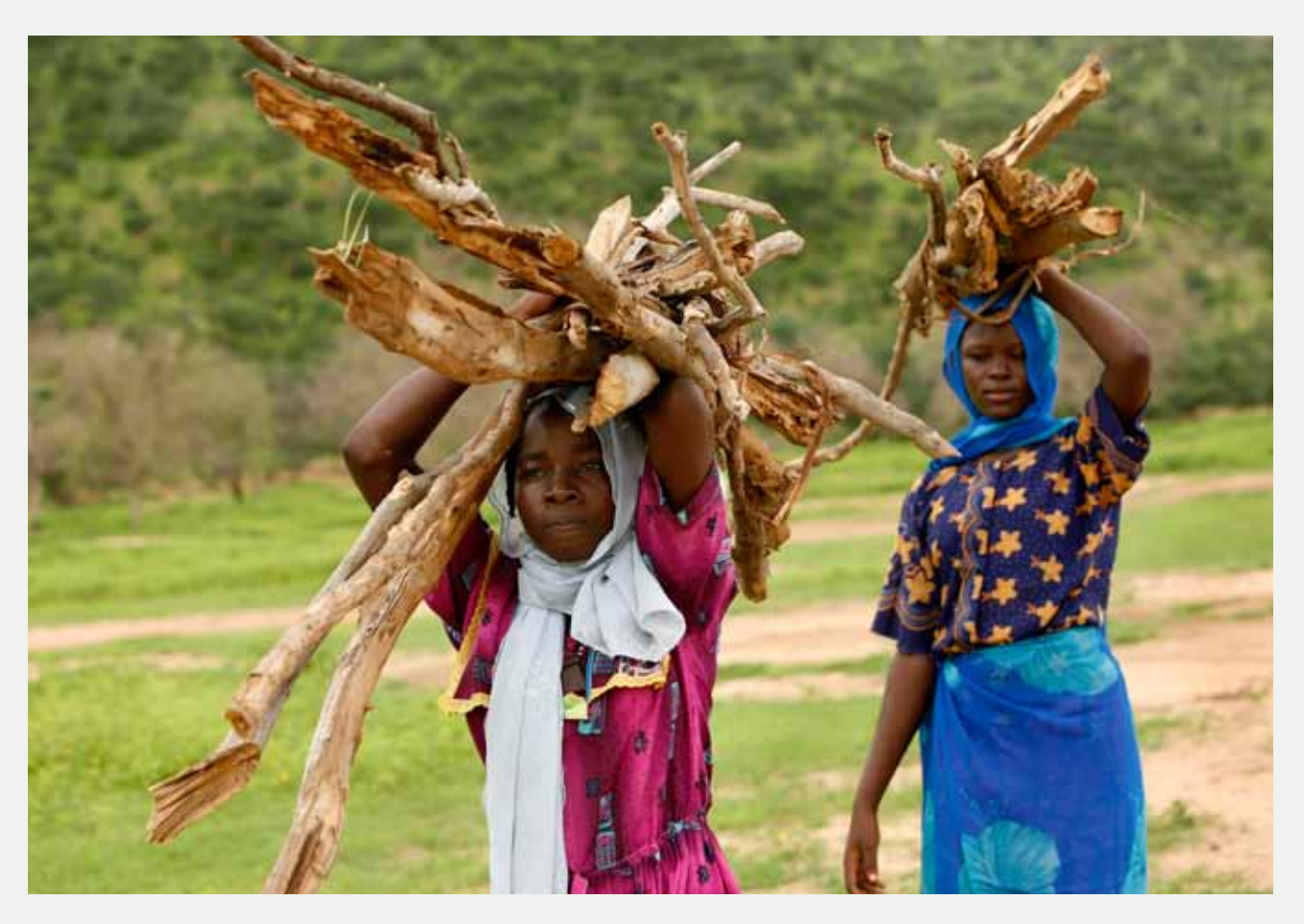
When girls, like these girls in Ouaddai, Chad, have to spend many hours collecting firewood, they have little time for school or other activities.

Firewood-related violence can be reduced in several ways, including providing appropriate cooking fuel along with food, and using alternative, non-wood-burning stoves. If safer ways of making money other than selling wood are available, girls will not need to leave camps to gather wood to sell.