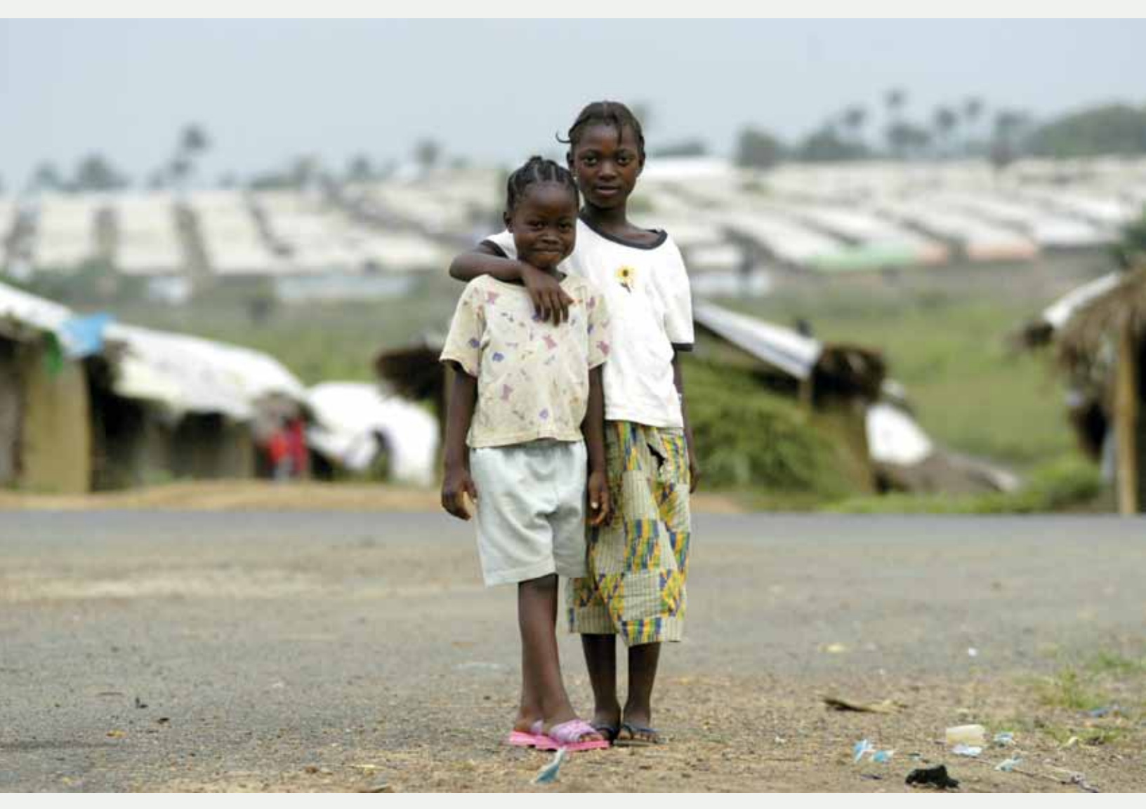
Liberia: Two girls stand together in the Perry Town camp for internally displaced persons, near Monrovia, the capital. UNICEF has set up a child-friendly space in the camp.