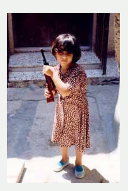
This girl is carrying a toy gun, but many girls who are conscripted as child soldiers carry—and use—real weapons.

With the right help, former child soldiers, girls and boys, who participate in well-run disarmament, demobilization and reintegration (DDR) programs and have access to education or skills training, can rejoin their families and become valuable members of their communities.