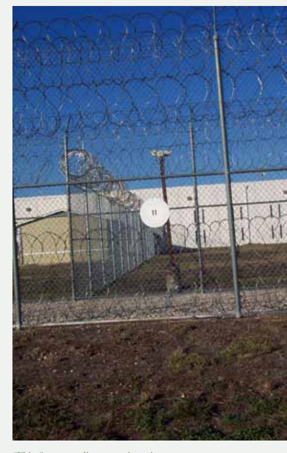
This former medium-security prison in Taylor, Texas, is used to detain immigrant families, including young children. Following advocacy by the Women's Refugee Commission and others, the concertina wire was removed, but the fence remains.

Children seeking asylum are often treated no better than criminals. They may be separated from their families at the border and placed in separate detention facilities, where they may be locked up for days, weeks, months and even years