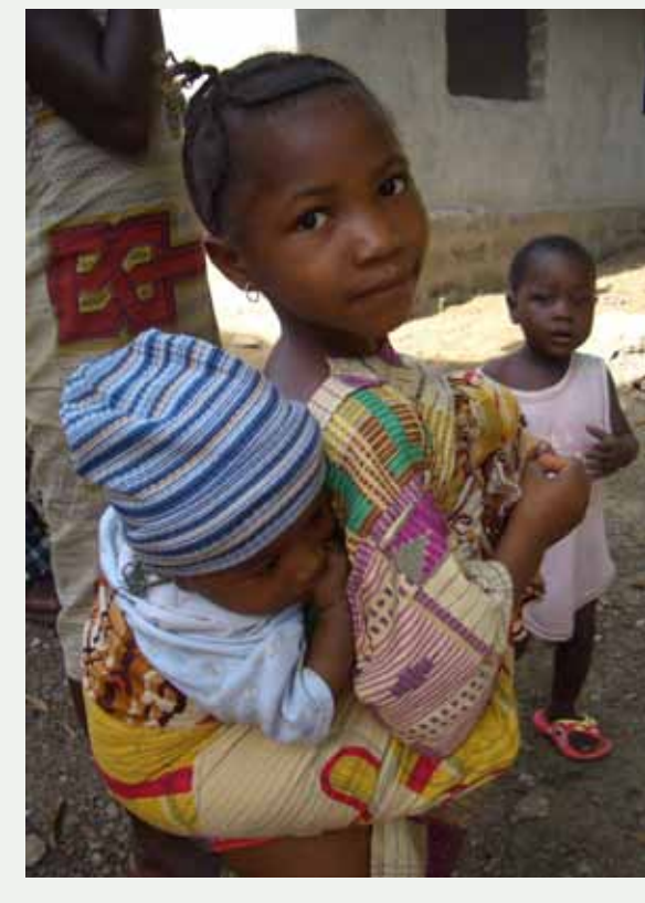
Girls, like this one in Sierra Leone, are often responsible for caring for younger siblings, which means they cannot attend school.

But there are hopeful examples of programming that is focusing on the health needs of girls and adolescents. For example, the Straight Talk Foundation's Gulu Youth Centre in northern Uganda reaches out to young people through youth clubs and peer educators. The center offers recreation such as volleyball and basketball; entertainment with music and dancing; health education through radio; and free sexual and reproductive health services, including family planning and testing and treatment for sexually transmitted infections. The center's success shows the importance of youth-friendly services in the effort to increase young people's use of health services, the need to work with community members to enhance understanding for young people's unique issues and the value of addressing the particular needs of displaced young people.