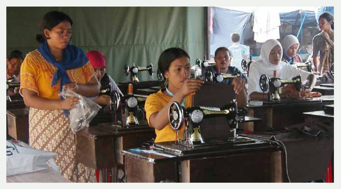
Women and girls are often encouraged to develop skills such as sewing and craftwork, which are less lucrative than more typically "male" skills, such as carpentry. Livelihoods programs for refugees need to be based on market needs.

Prioritizing safe livelihood strategies that will enable employment in the local market can help prevent adolescents' conscription into military forces, prostitution and other exploitative labor practices, greatly improving the likelihood for lasting peace.