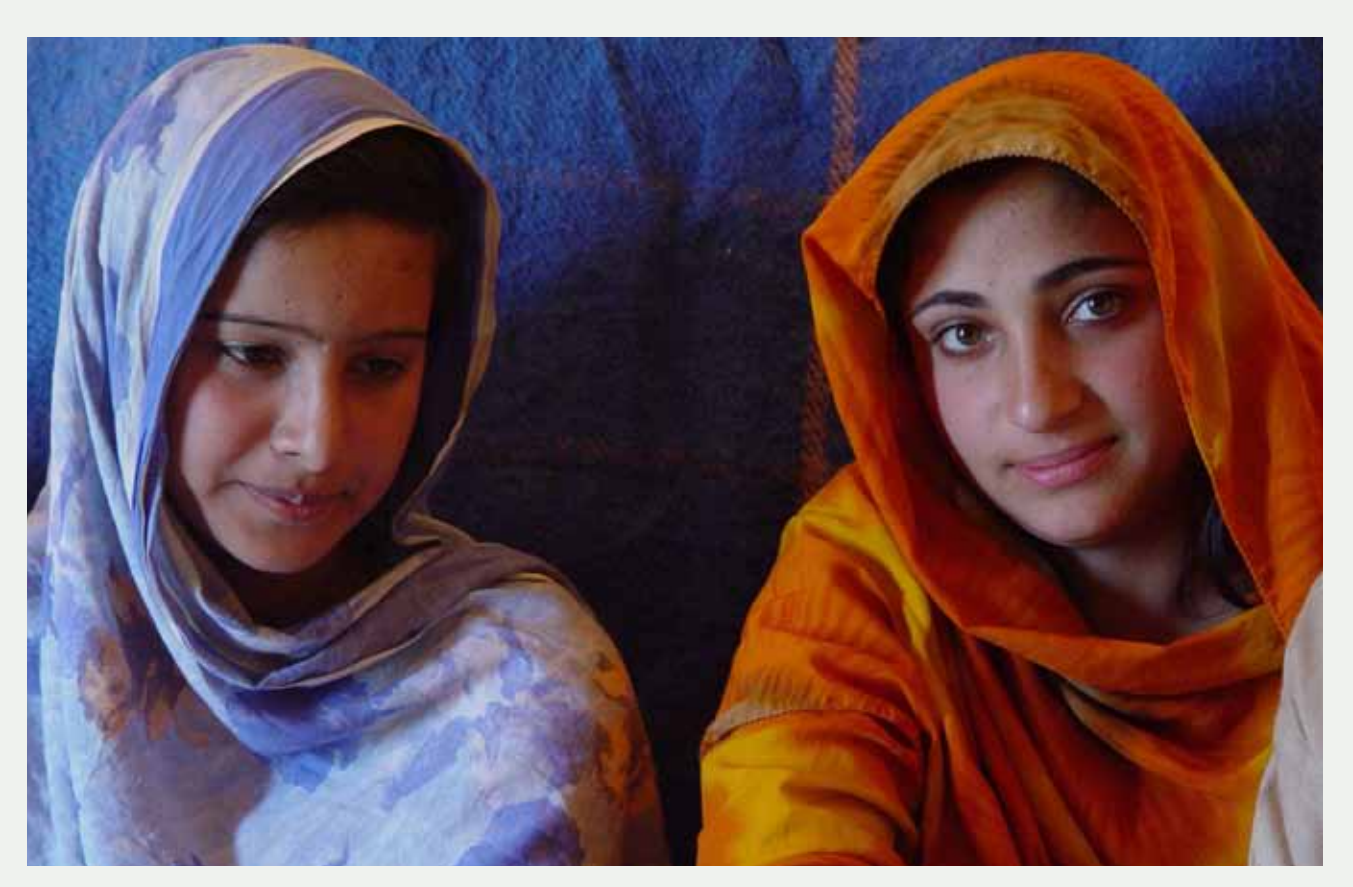
Girls, like these Afghan refugees in Pakistan, are resilient despite all the problems they face.

This book is an attempt to tell the untold story of the millions of refugee girls whose voices are almost never heard. While much of the refugee experience for girls is difficult and depressing to read about, refugee girls are resilient and strong. Their lives are not easy, yet they strive to make the most of the opportunities they are offered.