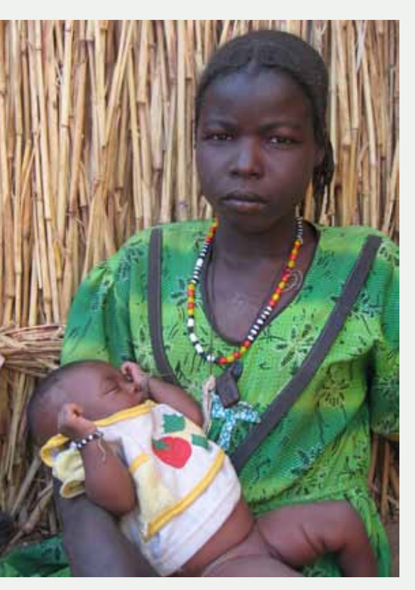
Early motherhood is common in refugee settings, where reproductive health services are often not available, especially at the beginning of a crisis.

A UNICEF survey found that girls in war-torn southern Sudan in 2004 were more likely to die in pregnancy and childbirth than to finish primary school.