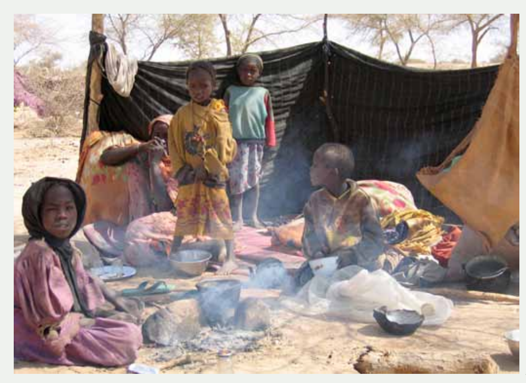
In refugee camps, many are forced to share small, rudimentary shelters which offer little privacy and are often far from a water source or latrines.

Honor killings are found to increase dramatically in wartime. Girls and young women are the principal victims. Desperate families feel pressure to arrange early marriages for their daughters and sisters — sometimes as a means of protecting them from random sexual violence, often so that there is one less mouth to feed and, possibly, to accrue some financial gains from the marriage. To ensure the desirability of daughters and sisters to prospective grooms and their