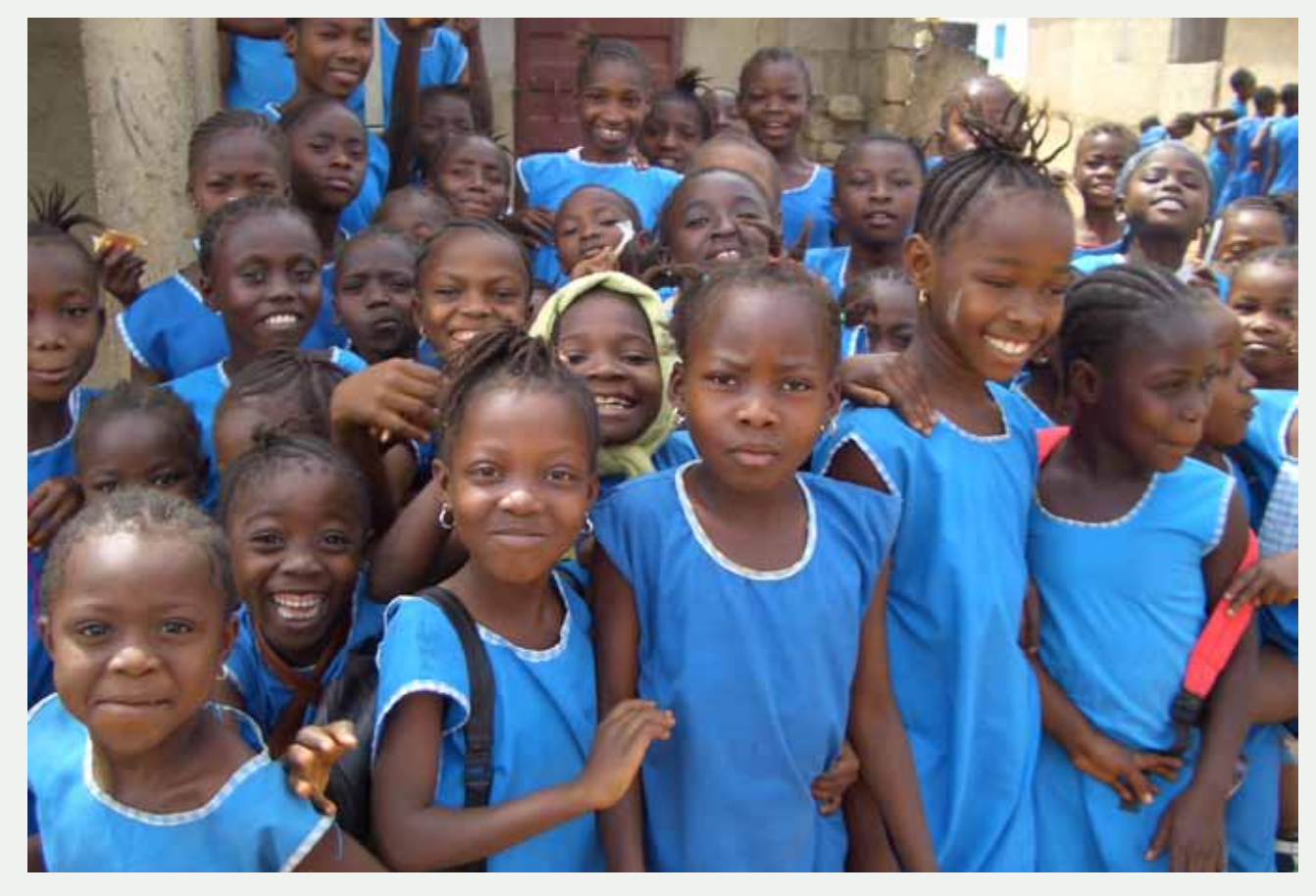
Families make great sacrifices to send their daughters to school. Even when education is free, families must pay for uniforms and supplies.

recommendations. Education helps mothers learn what children need to stay healthy and how best to provide them with adequate nutrition and hygiene. Promoting education for girls is the single most effective way to encourage and achieve healthier families.30