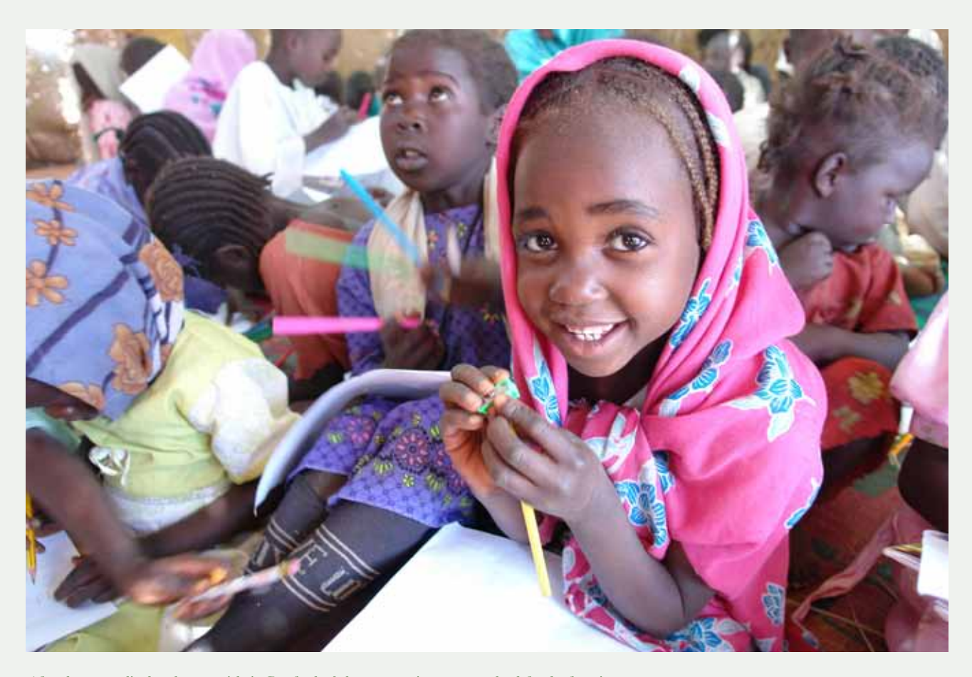
After they were displaced, some girls in Darfur had the opportunity to go to school for the first time.

Although many refugee girls do not have the opportunity to go to school, others are able to attend classes, especially at the elementary level, for the first time when they are in a refugee camp. Emergencies can provide opportunities to work with displaced communities for social transformation.<sup>13</sup> Organizations and networks such as the Inter-Agency Network for Education in Emergencies (INEE) are leading the charge to ensure that all children who are affected by armed conflict are able to go to — and stay in — school.