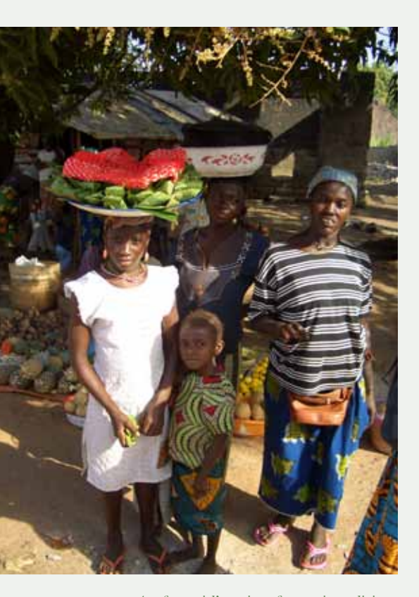
A refugee girl's options for earning a living are limited, and may include selling produce in the market, as here in Sierra Leone,