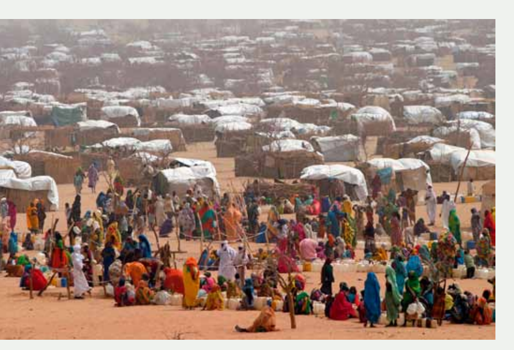
Refugees and temporary shelters crowd the landscape at the Iridimi Refugee Camp near Iriba, Chad.

Latrines are generally squeezed in wherever space can be found, at distances that are either too far to be easily accessible or too close to be environmentally safe. If they are too far from dwellings, or the lines for their use are too long, refugees will