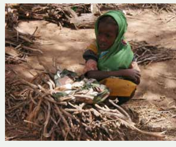
Girls are at risk of sexual assault when they collect wood for cooking or to sell.

In Darfur, as in other regions throughout the world, one of the gravest risks faced by girls collecting firewood is sexual assault by armed men. Women and girls collecting firewood in Darfur are prime targets of military and security forces and the government-backed Janjaweed militia, which are all aware of