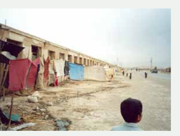
Twenty-four Afghan squatter families lived in former stores in Shamshatoo Camp, Afghanistan, after they returned from Pakistan.

Even if an individual woman or girl has a strong claim that should entitle her to resettlement, her claim can be overridden or superseded by a husband's or father's claim or through procedures that determine asylum status for an entire group.