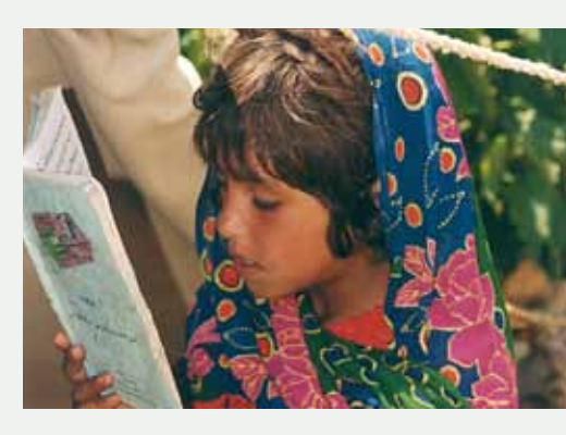
Refugee classrooms are often overcrowded. Sometimes there are no classrooms, and students meet in the open.

TOP: IRC school, Guinea. MIDDLE: Tanah Pasir School, Aceh, Indonesia. BOTTOM: Afghanistan.