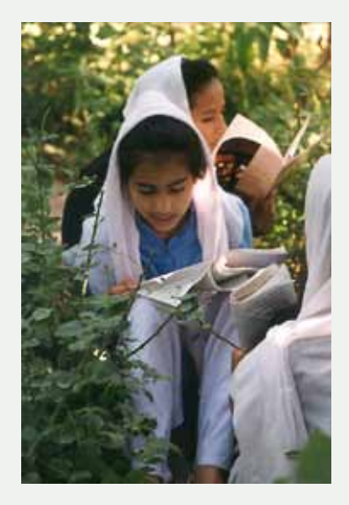
Refugee children are hungry to learn, even in difficult circumstances. Here, stolen moments in Afghanistan.

Educated mothers are more likely to seek prenatal care and have births attended by trained health care workers, and are more likely to understand and follow their