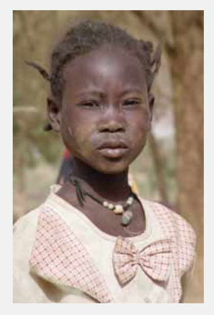
Displaced girls like this girl in Darfur, Sudan, are vulnerable to many threats.

Forced impregnation has also been deployed in recent conflicts in East Timor, Kosovo and Rwanda, where tens of thousands of girls have suffered the trauma of being raped repeatedly and impregnated by their violators. In Rwanda, babies born from this kind of rape are called "enfants du mauvais souvenir" ("children of bad memories") or "devil's children." In Kosovo, they are called "children of shame."