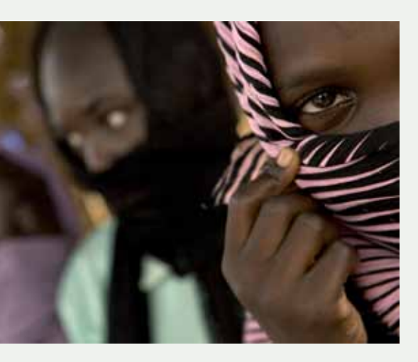
A 12-year-old girl (right) who lives at the Abu Shouk camp for displaced people near the city of El Fasher, capital of North Darfur State, relates how she was separated from two friends while on a mission to gather firewood, and raped by government soldiers. Although the incident was reported to police, no follow-up action was taken.