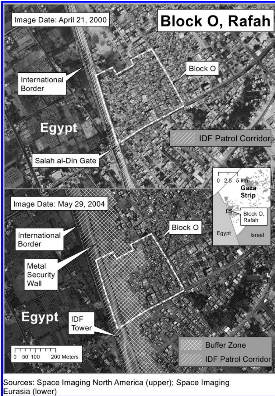
Figure 3. This map, based on satellite imagery, depicts the “Block O” section of Rafah, one of the epicenters of “buffer zone” demolitions—over half of the neighborhood was leveled between 2000 and 2004. Note how the military patrol corridor on the border doubled in width between the two images, creating a new “baseline” for demolitions. (Human Rights Watch).