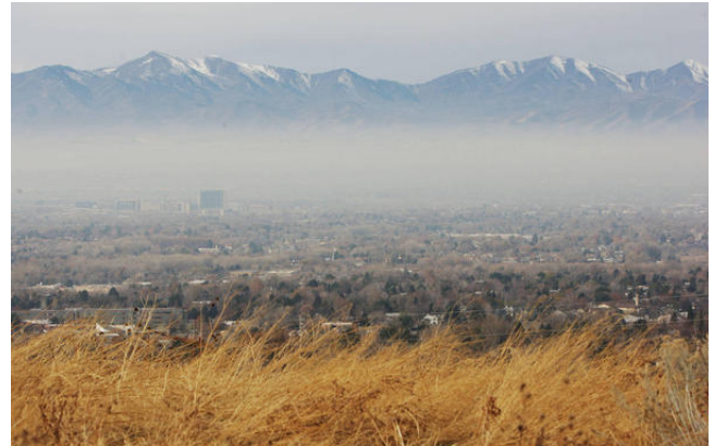
Uintah County, Utah ranks in the American Lung Association’s list of the top 10 Most Ozone-Polluted Counties. 18