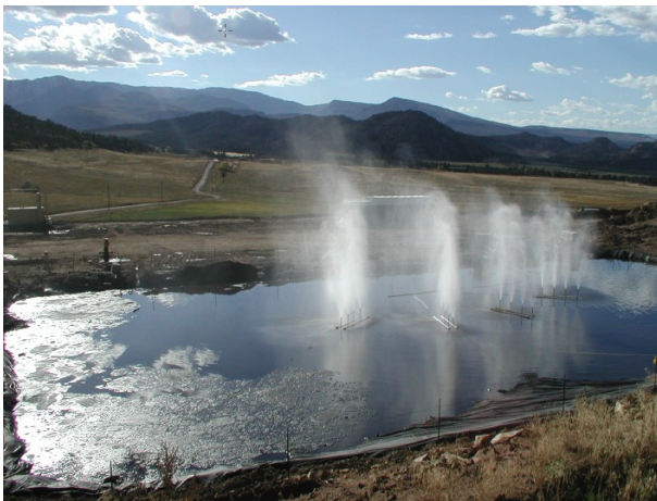
Fracking wastewater, laden with toxic chemicals, is often held in open-air pits. In this one, misters are used to encourage evaporation, sending toxics airborne. 4

The process of hydraulic fracturing, or “fracking,” a is a newer and more dangerous version of natural gas and oil extraction. Designed to enable the extraction of previously untapped gas and oil reserves, fracking pumps a high-pressure mixture of toxic chemicals and water underground to fracture deep shale rock formations. The shale-gas boom of the past 15 years is unprecedented, bringing heavy industry into proximity with over 15 million Americans. 1