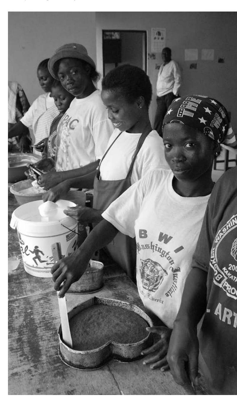
Ex-combatants participate in skills training at the Booker Washington Institute, as part of the rehabilitation and re-integration process in Kakata.

Promotion of gender sensitive standards for the lay out camps in accordance with the IDDRS has resulted in separate facilities for women, men and families. This has taken place, for example, in Burundi , Cote d'Ivoire , DRC , Liberia and Southern Sudan . In Burundi , in 2007, the Mission assigned female staff to camps and demobilisation centres to improve security for women. In Cote d'Ivoire , the UNOCI Gender Unit, since its outset in 2005, was engaged in improving security at DDR cantonment sites.