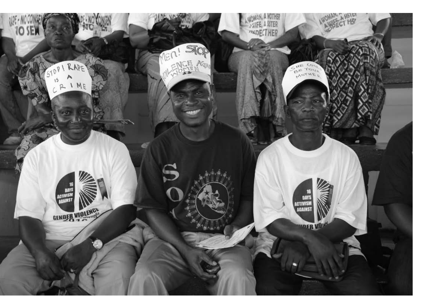
Liberian men attending one of the 16 Days of Activism events at the Samuel Kanyan Doe Sports Complex in Monrovia, 25 November 2010, Monrovia, Liberia.

Overall, sexual and gender-based violence remain overwhelming problems in the countries under review. Despite efforts to decrease SGBV in Liberia, rape (including gang rape) is the number one crime reported to the police. Victims as young as 10 years old, and increasingly juvenile perpetrators are reported. In Burundi the only type of gender-based violence reported to the police is rape; there were 1306 cases reported in 2008 and 2009. In Afghanistan, women and girls who run away from gender-based violence at home are often punished with more violence and oppression. They are likely to be accused of adultery and incarcerated. Suicide and self-immolation in such circumstances have been reported by human rights activists. 46 In Timor-Leste domestic violence is widespread (an estimated one third of all prosecution cases relate to SGBV). Female genital mutilation remains a serious concern in Cote d'Ivoire, Chad,