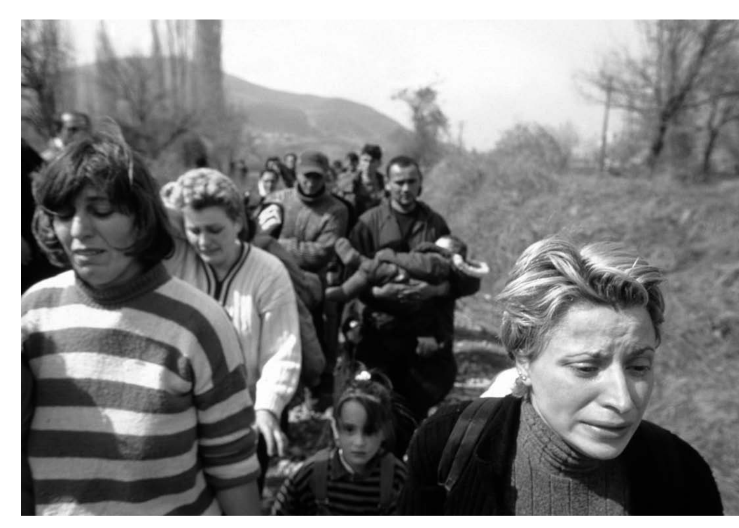
Kosovar\ refugees\ fleeing\ their\ homeland, 1\ March\ 1999,\ Blace\ area,\ Former\ Yugoslav\ Republic\ of\ Macedonia.\ \odot\ UN\ Photo/LeMoyne

The involvement of women in camp governance and activities has been variable. Women headed, and according to OCHA effectively managed, three of 100 IDP camp management committees in Burundi in 2001; others had at least one woman among their five members. UNHCR was reported to have achieved gender balance in camp management committees through enforcement of a gender parity policy. Female IDPs and refugees were reported to have received the same benefits as males. In the economic recovery programmes they constituted 18% of the beneficiaries of labour intensive construction schemes, 60% of those receiving vocational training and 64% of those in income generating activities. Women were said to be inadequately represented in IDP camp