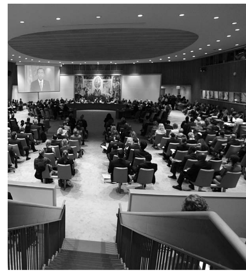
Security Council members and participants listen to a video message from Secretary-General Ban Ki-moon commemorating the 10<sup>th</sup> anniversary of Resolution 1325, 26 October 2010, United Nations, New York.

Despite these achievements at an institutional level and calls from the Security Council to respect the equal rights of women in conflict-affected countries, women and children continue to suffer the devastating effects of conflict. They account for the majority of casualties and of displaced people and they have