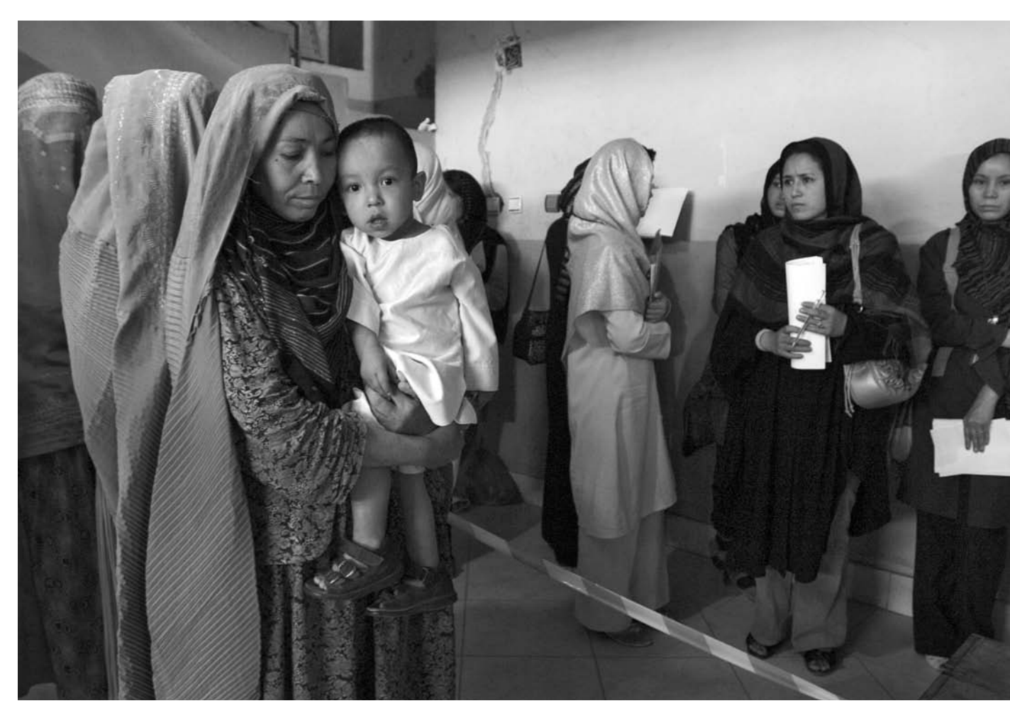
Afghan citizens wait in line to exercise their constitutional right to vote in presidential and provincial council elections, 20 August 2009, Kabul, Afghanistan.

countries improved security around elections, due to the efforts of UNPOL and national police, has enabled more women to vote. Women consulted in DRC , for example, highlighted the fact that MONUC police had ensured their safety to participate in the 2006/2007 elections. In Afghanistan, despite the threats of the Taliban and other constraints, the turnout of women voters was high in both the 2004 presidential elections (42%) and the 2005 national parliamentary elections (44%). There was one female candidate in the 2004 presidential election, and in 2009 the two women presidential candidates finished in the top 15 of 42 candidates. 18 In DRC, in the 2006 elections, the first in the 46 years since independence, women were successfully mobilised as voters (60% of registered voters and 51% of votes cast) and as candidates (12% of presidential candidates and 10% of those running for governor). Women make up 8% of the parliament, 5% of the senate and 12% of the government.<sup>19</sup> In Sierra Leone the proportion of women in parliament increased from 1% in 1982 to