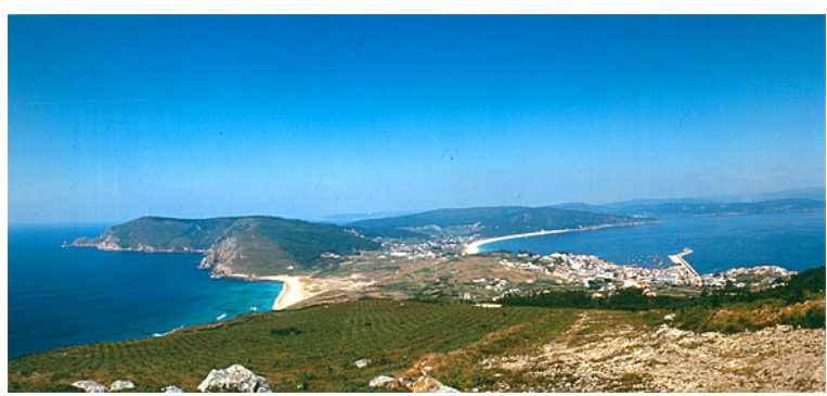
Figures 2a, b. According to some historical accounts, the Celts sailed to Ireland after departing from the Fisterra coastline, which is shown here.