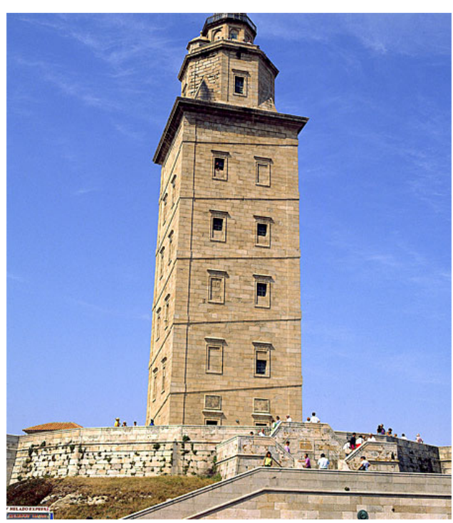
Figures 4a, b. The completely restored Tower of Hercules is an important monument in the city of A Coruña, Galicia.

Galicia's past and thus could not legitimate Galicia's ancestry.