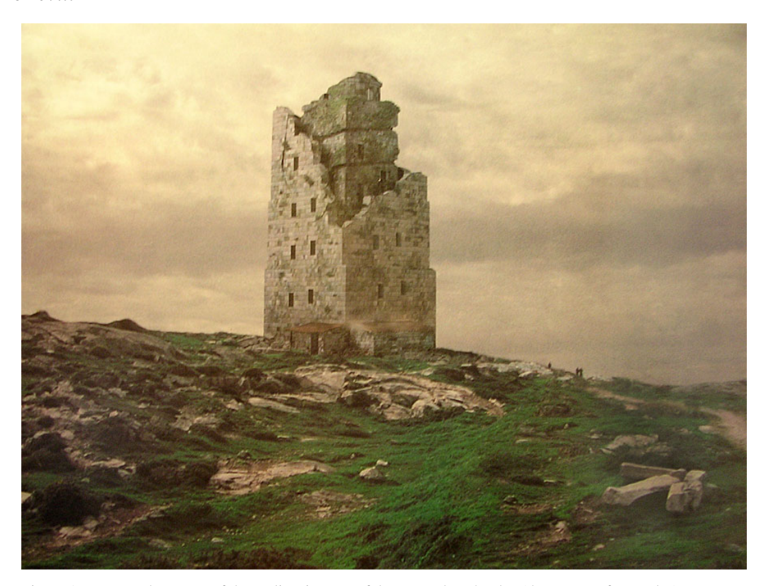
Figure 1. Here we have one of the earliest images of the Torre de Hércules (the Tower of Hercules). It was constructed by the Romans in the second century BC.