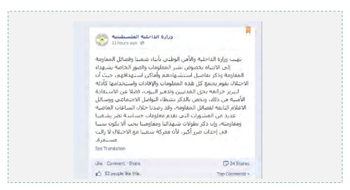
The notice posted by the ministry of the interior in the Gaza Strip (Facebook page of the ministry of the interior, August 5, 2014).