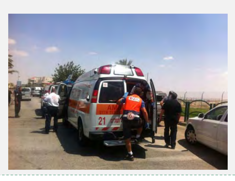
Evacuating the wounded security guard to a hospital.