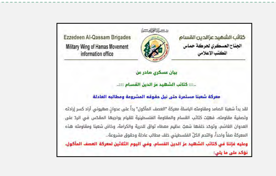
The Izz al-Din al-Qassam Brigades' statement regarding the negotiations (Qassam.ps, August 5, 2014)