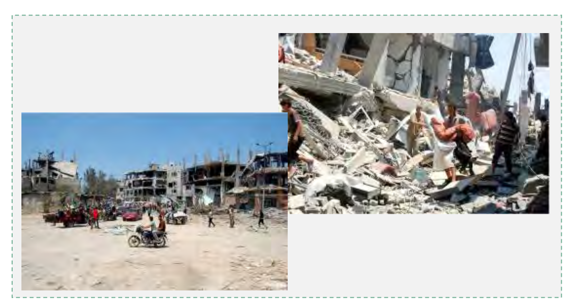
Residents of Rafah and Shejaiya return to their houses (, August 5, 2014).