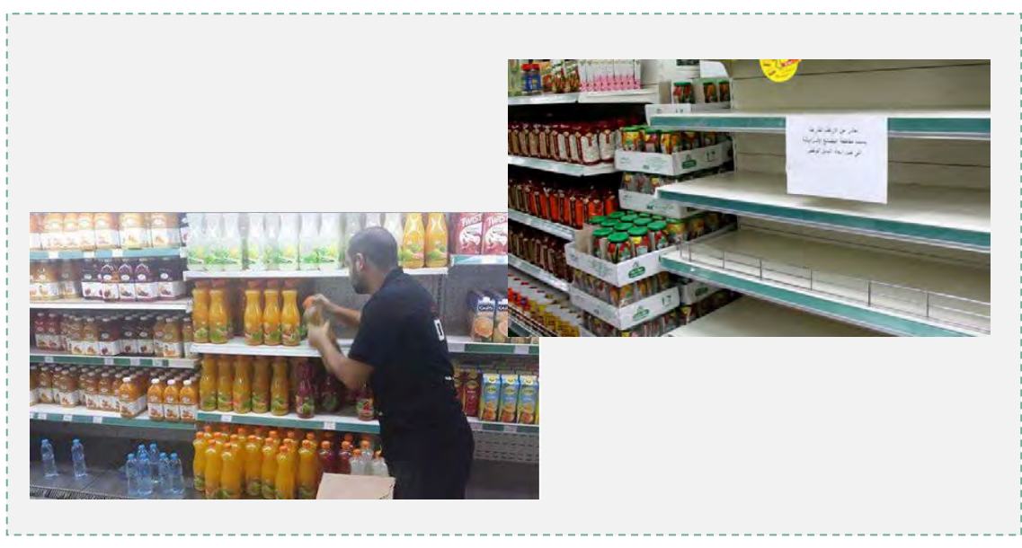
Taking Israeli-made products off the shelves (PNN TV, August 5, 2014)

18. The Palestinian society for consumer protection initiated a campaign to remove Israeli-made products from the shelves of stores in Palestinian cities and to encourage the sales of Palestinian-made and imported merchandise. The society claimed that the money Palestinians paid for Israeli products eventually reached the IDF and purchased weapons used against the Palestinian people. The campaign has already begun in Bitunia, Hebron and Tulkarm (PNN TV, August 5, and Wafa.ps, August 6, 2014).