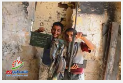
(From the Facebook pages of the Palestine Network, August 5, and Paltoday.tv, August 6, 2014)