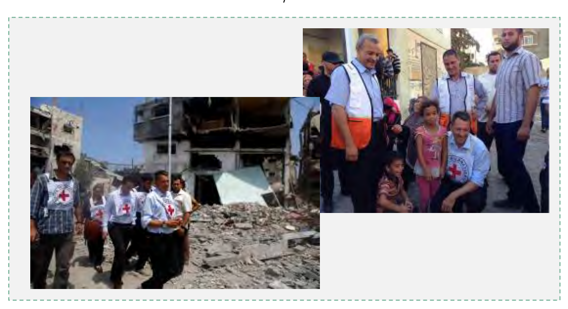
The president of the International Red Cross visits the Gaza Strip (Icrc.org, August 5, 2014)