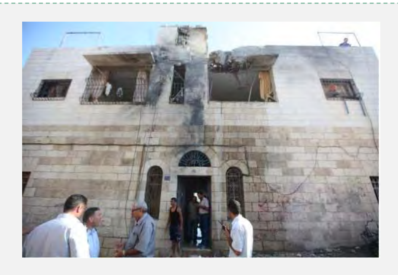
The house in Beit Sahour, near Bethlehem, hit by a Hamas rocket (Alquds.com, August 4, 2014).

to the announcement, the barrage was fired in response to IDF activity in the Shati and Rafah refugee camps (Qassam.ps, August 5, 2014).