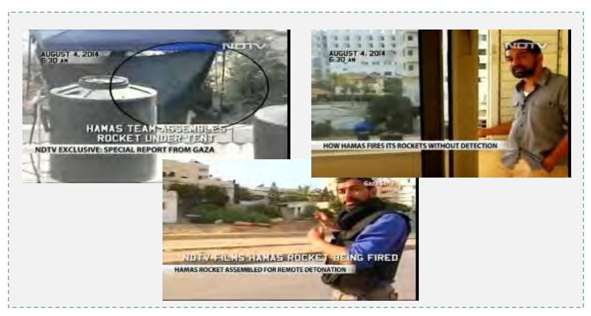
Left: The blue tent erected to hide the operatives. Right: The correspondent next to the window in his hotel room. Bottom: He tries to approach to launch site. Click https://www.youtube.com/watch?v=k_ihf2omMX4 for the video.