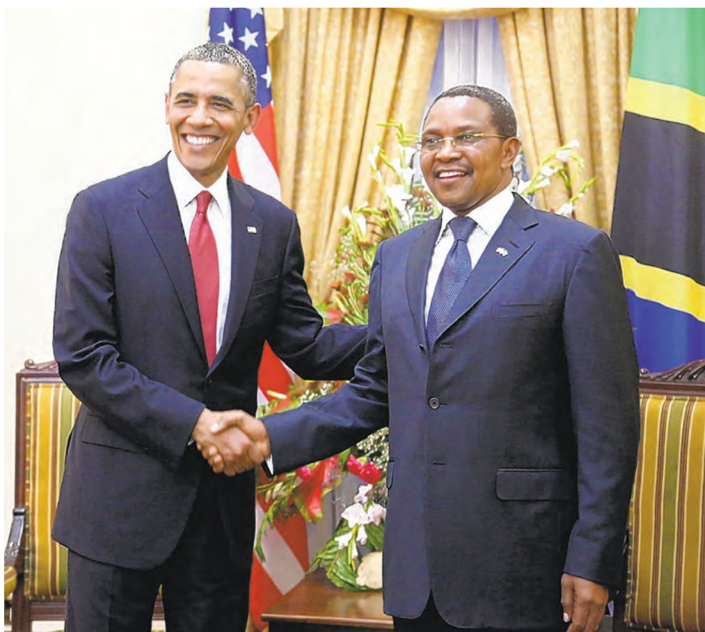
President Jakaya Mrisho Kikwete welcomes President Barack Obama at State House, Dar es Salaam, on July 1, 2013

predominantly composed of young people, we in Tanzania, find this Summit and its theme, of "Investing on the Next Generation" to be very opportune indeed. Putting the interest of Africa's youth at the centre of the Summit agenda is the right thing to do. We must empower our young men and women to play their rightful role as citizens of their respective countries, the African continent and the world.