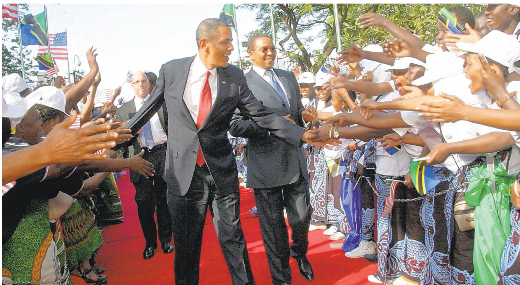
Teeming crowds welcome President Barack Obama on his arrival at State House, Dar es Salaam, on July 1, 2013.

Tanzania like many other African countries has made tremendous progress in all social-economic fronts in the past decade. Tanzania's economy grew at an average of 7 percent. We expect 7.2 percent economic growth this year. Inflation is currently (June) at 6.4 percent and our target is to bring it down to 5 percent or less by June 2015. Since this strong macroeconomic performance is a function of sound economic policies being pursued by the government in line with the on-going economic reforms, we are committed to sustaining the course of