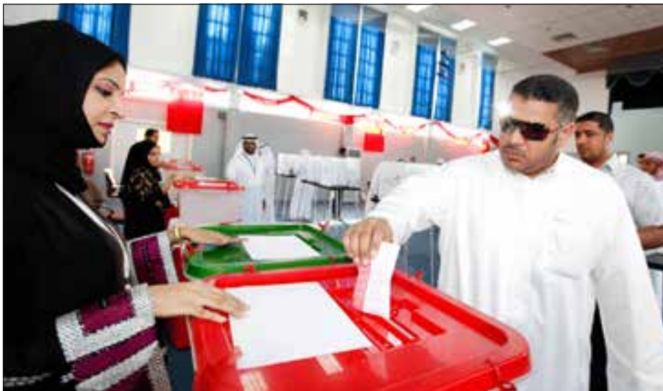
■ A Bahraini casts his vote in an earlier election in Isa Town