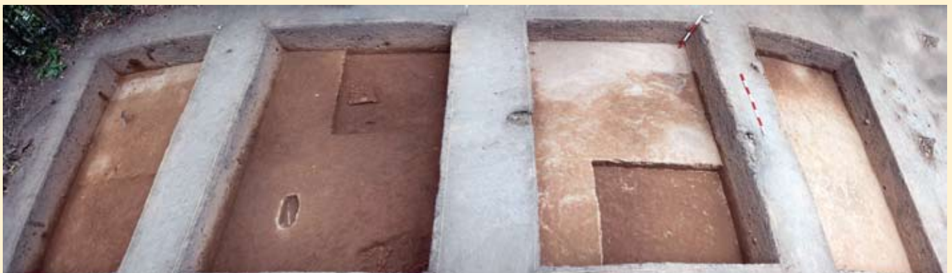
Panoramic view of the four trenches in 2010

When did human habitation begin at Pattanam? High-precision AMS 14 C dating on charcoal samples reveals that it was in the Iron Age phase (around 1000 B.C.) that native settlement began. This is further supported by the presence of Iron Age artefacts/antiquities such as Black and Red ware (BRW), red coarse ware and iron objects in the aeolian sandy layers at depths varying from 340 cm to 370 cm.