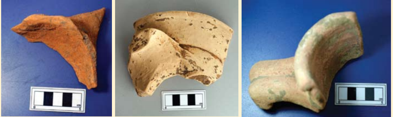
Mediterranean amphora sherds

The pottery carries the fingerprints of the people of ancient Tamilakam and can be a reflector of their social and physical environment. It is also an indicator of their mastery over tools, skills and cultural interactions. The diagnostic pieces (rim and base), those with designs, grooves or impressions, edge ground and those with other distinct features, are sorted, documented and conserved. Unlike most Indian sites where the body sherds of coarse ware are usually discarded after weighing and numbering, we are storing them for further studies. They can also be designed as souvenirs or museum exhibits.