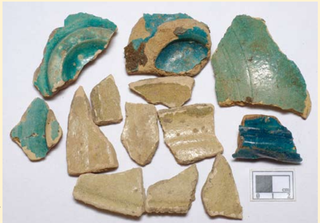
Turquoise Glazed Pottery sherds