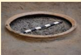
Terracotta rim at 345cm depth

The imported and fine pottery assemblage comprises Roman, West Asian, Indian Rouletted Ware (IRW) and a host of other unidentified fine wares. The number of Roman amphora and Terra Sigillata sherds excavated at Pattanam continues to be impressive and it is perhaps the largest assemblage of Roman pottery in India. It will have deeper implications in understanding the Roman role in Indian Ocean trade. This season alone brought out over 2,000 amphora sherds.