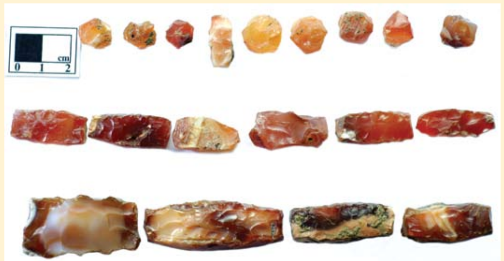
Semi precious stone rough-outs

Personal Adornment: Objects of personal adornment seem to have had a pride of place at Pattanam. Many of the copper and gold objects appear to be fragments of ornaments or cosmetic tools such as antimony rods. Lapidary items such as stone beads, cameo blanks, micro inlays, pendants and glass beads are substantial quantity