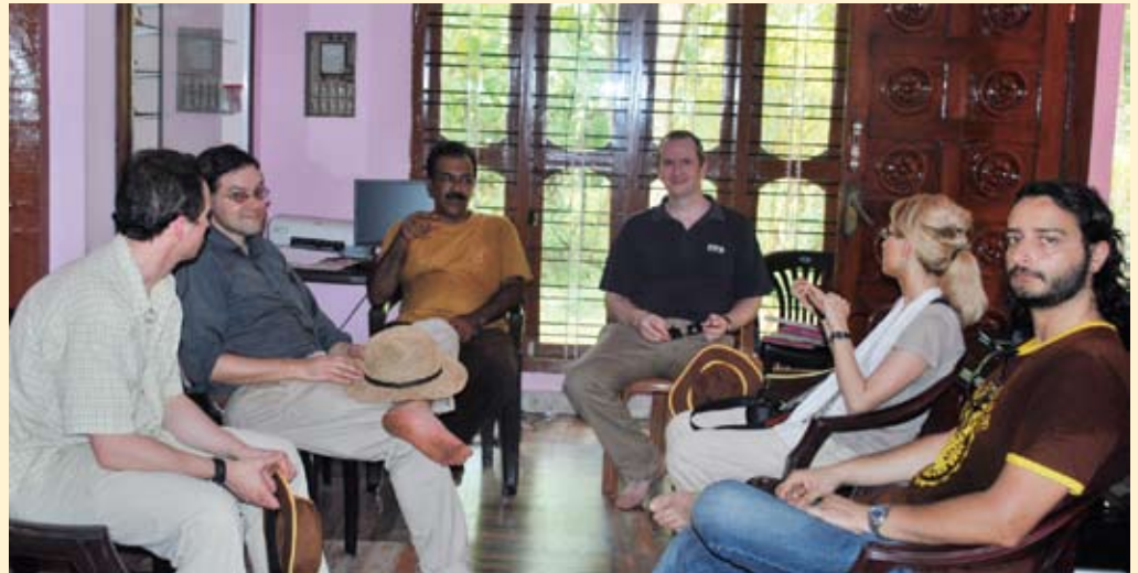
Some members of the Oxford team at Pattanam

(CDIT), Trivandrum. Students from the Universities of Oxford, Rome (Tor Vergata), Paris (Sorbonne), University College London (UCL) and various Indian universities participated in the excavations. A select number of school and college students were imparted training in the Field Archaeology School.