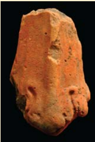
Lion faced corner tile

Broken Rim with Brahmi script: This rim sherd with pre-firing marks of four Brahmi letters was found at a depth of 138 cm. This find has a special significance considering the scantiness of inscribed potsherds at Pattanam. This is the first pre-firing pottery inscription from Pattanam, though some sherds with post-firing graffiti were found in the earlier excavations. The letters are identified as 'daa' (?) 'ta', 'ni' (?), 'ka'. Comparative study of scripts from contemporary sites in Tamilakam as well as the Red Sea port sites of Berenike and al-Qadim (Myos Hormos) may shed more light on this find. The dearth of inscriptions and graffiti on potsherds could be due to perishable nature of writing media – palm leaves or papyrus. It may be recalled that the AD 2nd century Muziris document, the legal contract between a Muziris merchant and a shipping agent, was on papyrus. An interesting find of this season in this connection was an iron stylus — ezhuththani or naaraayam .