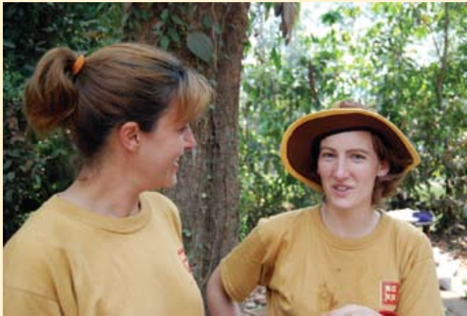
Researchers from Italy and France at Pattanam