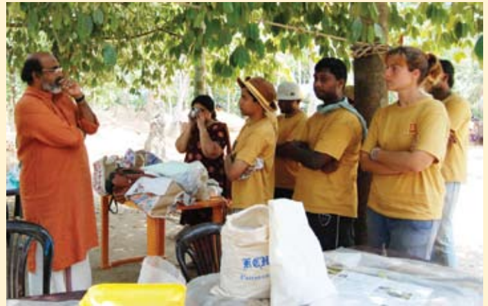
Dr Thomas Isaac, Minister for Finance at Pattanam

Peat is a spongy layer of botanical remains deposited over a long period of time. Due to slow oxidation, the decomposition is slow and the plant sediments survive centuries, and subsequently transform into fossils. Peat was seen below the Iron Age layers and further down in the natural layers. Besides organic sediments such as roots, leaves, bark and seeds, the peat layer included frankincense.