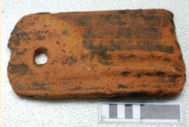
2000 year old triple grooved roof tile