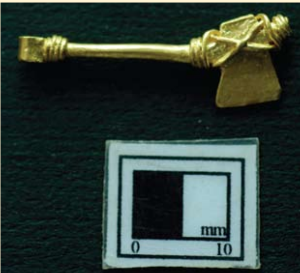
Miniature golden axe

and variety. As in earlier seasons, the semi-precious stone debitage in the Early Historic layers implies that lapidary workshops were active at the site. The artisans of Pattanam seem to have been familiar with advanced stone-cutting technology.