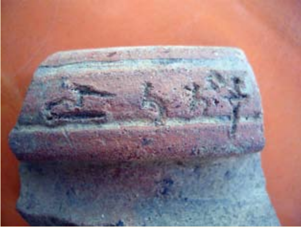
Brahmi script on rim sherd