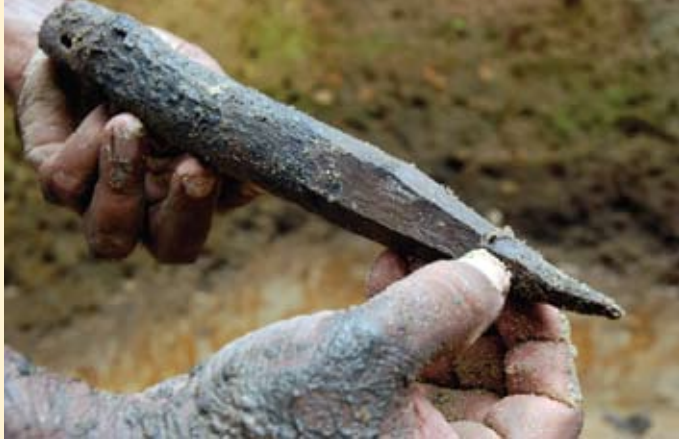
One of the 18 wooden spikes