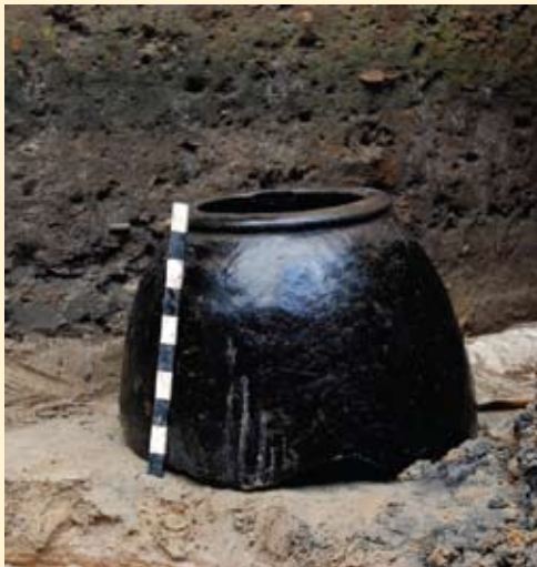
Soakage jar found 4 m down in the trench

Further, the dominant presence of IRW in the Indian Ocean rims may point to the importance of Indian Ocean exchanges in the development of Roman trade. Pattanam is the first site on the West coast of India to provide such a large assemblage of IRW. This season alone produced over 2,300 sherds.