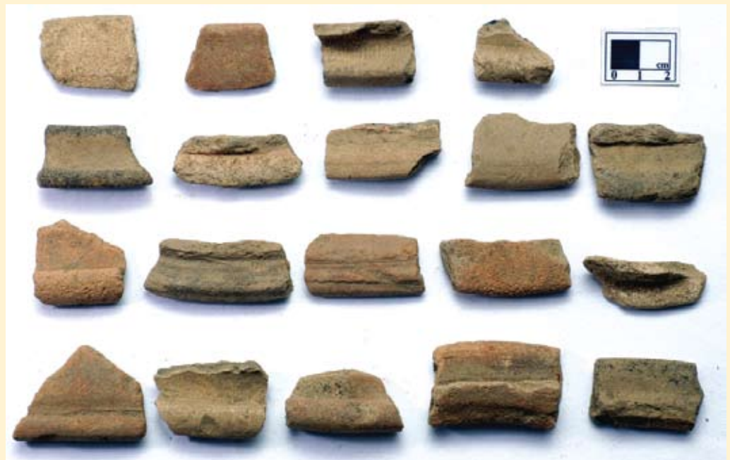
Local pottery sherds

Pottery: As in the previous seasons, both local and foreign pottery fragments continue to be the dominant cultural artifact. During this season, the local pottery sherds alone number a staggering two million. Dense habitation in the Early Historic period is obviously indicated by the abundance of finds in the corresponding strata. The small and medium sized terracotta bowls seem to be the most prevalently used ones since almost two-thirds of the rims excavated belong to this category. Cooking vessels were fewer in number, going by the presence of soot particles.