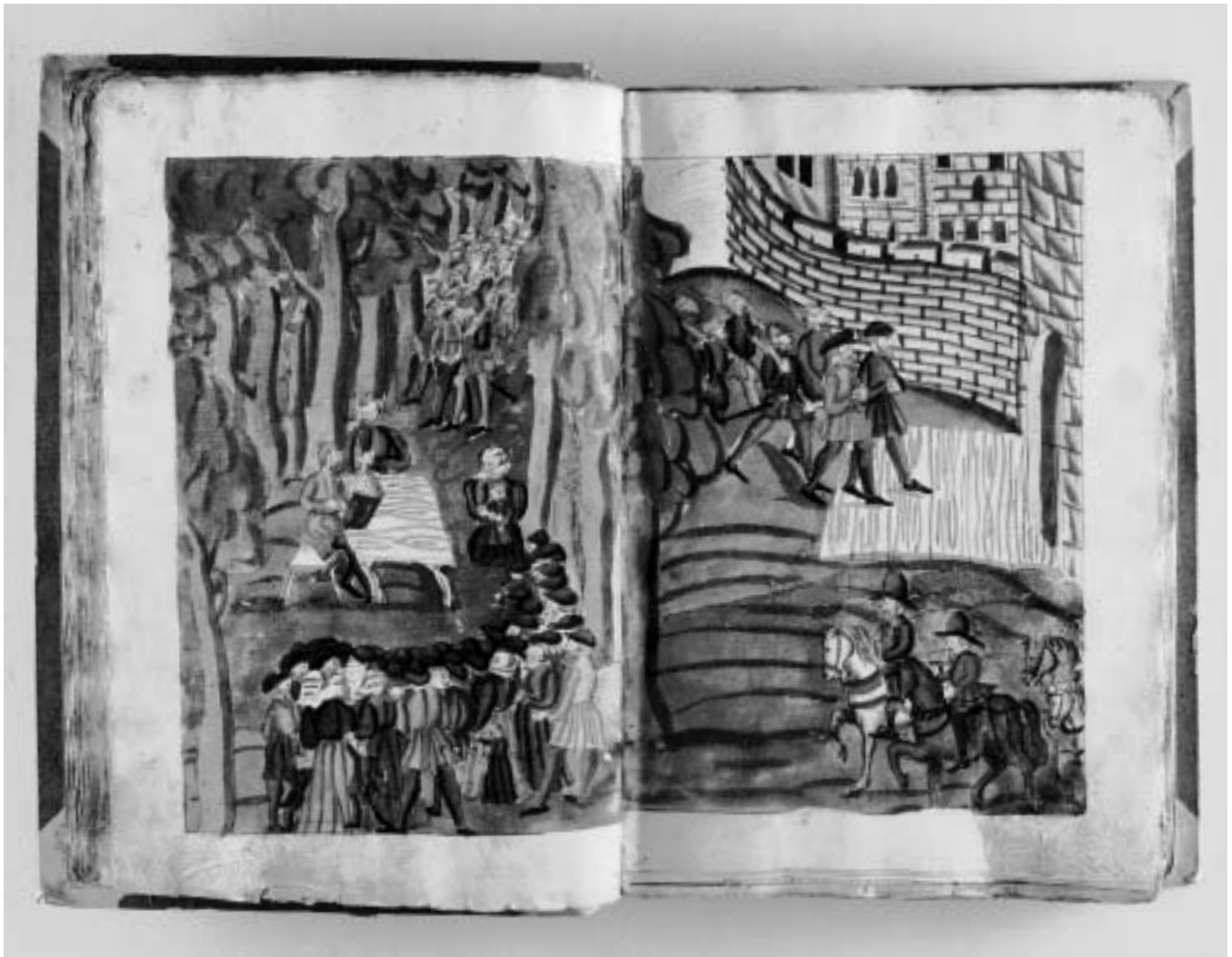
The disbanding of a nocturnal Anabaptist assembly near Altstetten ZH 1574