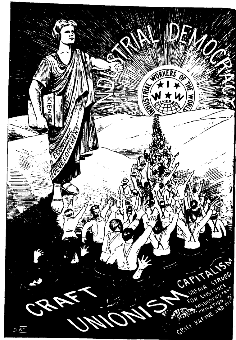
One Big Union Monthly, July 1920

To abandon American exceptionalism as an organizing theme is not, of course,