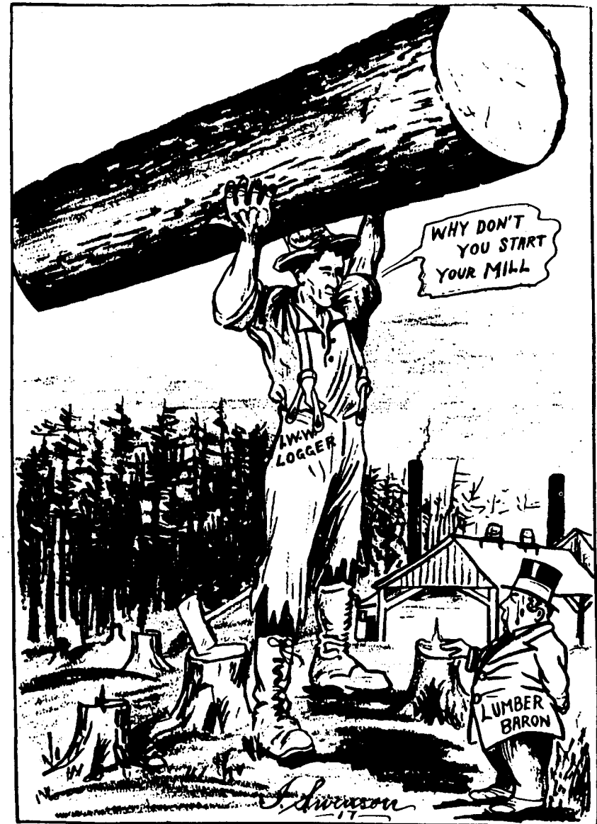
Industrial Worker, August 25, 1917

An entirely different set of answers to the 'why is there no socialism' question derives from the sociology of the working class itself, and examines aspects of the American social order that make it difficult for workers to organize successfully. The assumption is that socialist politics is unlikely to emerge in the face of an internally divided working class. The traditional assumption that capitalist development must produce an increasingly homogenous proletariat with a single set of interests, represented by unions and a political party, has given way before a recognition of the many kinds of divisions and stratifications built into the capitalist labor process itself. Divisions between the skilled and unskilled, craft and industrial