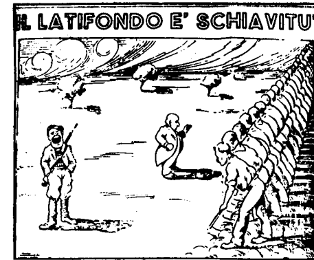
Centro siciliano di documentazione