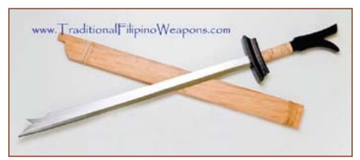
Please note: this sword is of a much larger dimension than most of the other filipino swords.