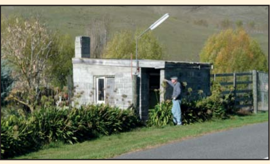
Drovers' Memorial Hut