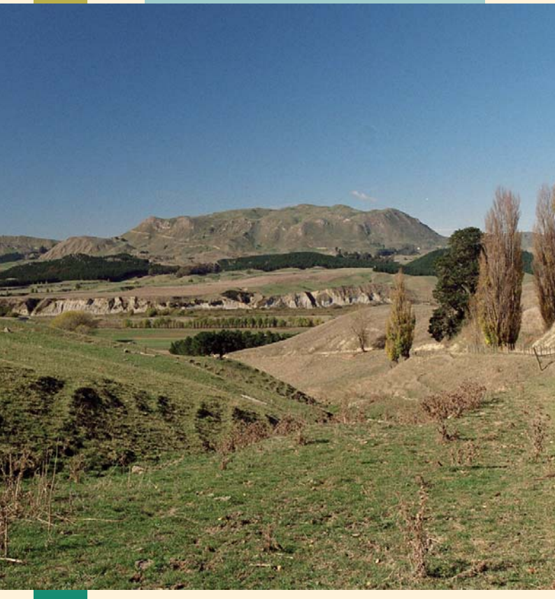
Mt Kahuranaki from Blind Road

Middle Road -Poukawa Valley (Tukituki River)