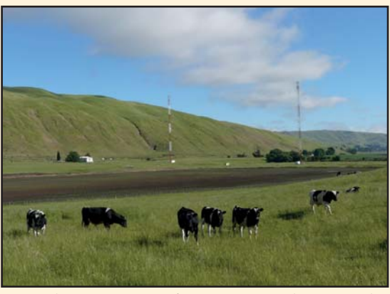
Opapa Radio Transmitting Station from Te Aute Trust Road

34.5km (7.5) Kauahei farm (#414) Mrs Pat Barker breeds coloured sheep and retails their fleeces either greasy or carded ready for spinning, attracting spinners and weavers from all over New Zealand (phone 06 878 1522).