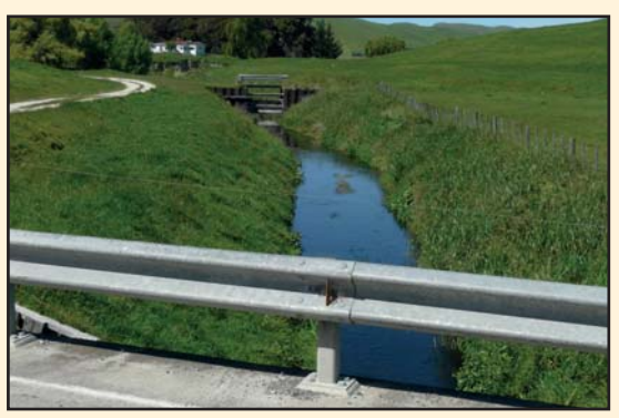
Lake Poukawa Control Gates

As the area in the vicinity of the lake is composed largely of peat there is a considerable fire risk in times of drought. A control gate, near Douglas Road at the northern end of the lake, was built in 1927.