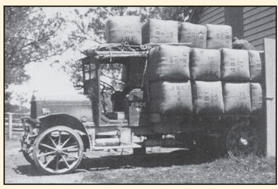
First load of wool to cross Tukituki River at Blind Road Awarua HT Pamphlet

The Tukituki River is regarded by anglers as a highly productive river for both rainbow and brown trout along its 120km length. Originating in the Ruahine Range behind Waipukurau the river flows across Hawke's Bay before entering the sea at Haumoana. There are vast areas of the river that anglers can legally access to fish. The Hawke's Bay Regional Council owns and administers large sections of the river which are available for public access. In addition Fish and Game New Zealand has negotiated access with landowners across some areas of private land. For further information please refer to Fish & Game New Zealand pamphlet 'Tukituki River Fishery'.