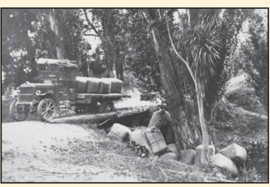
The load spills