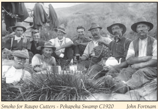
Smoko for Raupo Cutters - Pekapeka Swamp C1920

84.0km (3.0) Firth Industries Lime Quarry. In 1867 W A Amner, a lad of 16 years, arrived in Napier on the sailing ship Montmorency, the wreckage of which is in the sea approximately 30 metres offshore from Spriggs' Park, Ahuriri (see Ahuriri Heritage Trail pamphlet). In the late 1800s he established an almost two hectare quarry in