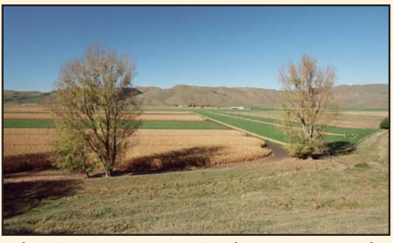
Poukawa Strip Farming - Brownrigg Agriculture

Since then further Brownrigg family members have continued reclaiming the land which is used for mainly cropping, sheep and cattle – Kobe beef being a special line. Strip farming is a visual feature of the type of agriculture practised in this area and even today tree stumps are still coming to the surface.