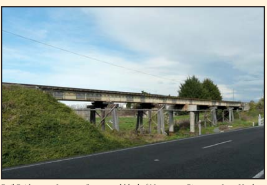
Rail Bridge over Irongate Stream - old bed of Ngaruroro River