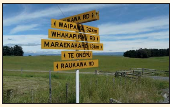
Signpost Ruakawa / Whakapirau Roads junction