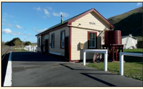
Opapa Railway Station