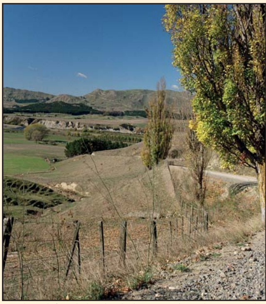
Mt Kuhuranaki from Blind Road - Tukituki River in mid-ground

Mount Kahuranaki, sacred to the Maori, was used as a navigational landmark or weather portent.