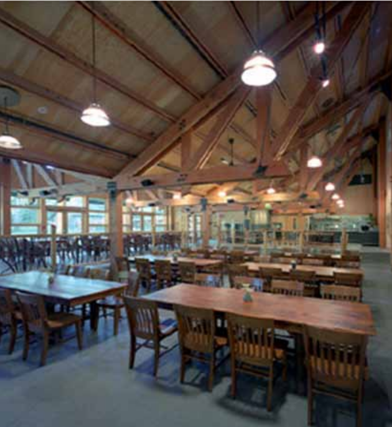
Left image: Islandwood Environmental Interpretive Center, Bainbridge Island, Washington Mithun Architects + Designers + Planners The Center was designed so materials can be reclaimed at the end of the structure's service life.