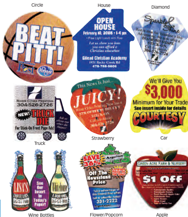
Pre-made die-cut shapes are as follows: Circle, House, Car, Truck, Pumpkin, Heart, Apple, Football, Strawberry, Wine Bottles, Shamrock and Diamond.