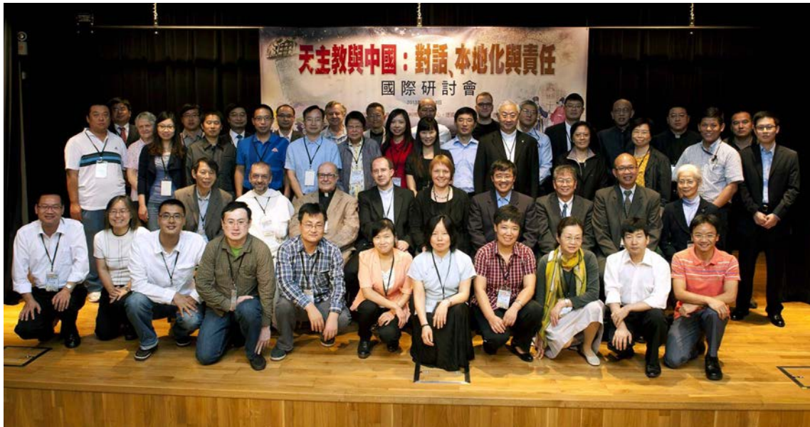
Conference participants in the meeting hall of the Caritas Oswald Cheung International House in Aberdeen.