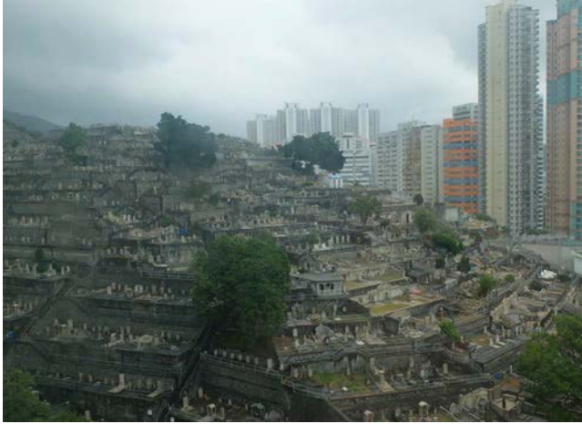
The Chinese Permanent Cemetery in Aberdeen.

The Indian, whose family has lived in Hong Kong for 30 years, has been turned away by many cemeteries on the grounds of his wife's ethnic or religious affiliation. In the Hindu cemetery, for example, where many Indians find a final resting place, no Christians may be buried. The church to which the family belongs is not a member of the Chinese Church Alliance, which is responsible for Protestant cemeteries in the city. The Chinese Permanent Cemeteries only accept the remains of ethnic Chinese. The family has also had no luck winning a burial plot in the lottery by which the city's public cemeteries make some gravesites available each year. The