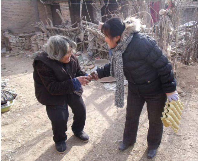
Volunteers such as this young woman from the Vincentian Fraternal Family in Hebei Province visit elderly people living alone in rural areas. They distribute food and clothes, help with laundry and cleaning, provide rudimentary health care and welcome personal attention.

care for the elderly. The document states that by 2020, a comprehensive domestic elderly care network should be in place, with the neighborhood communities ( shequ ) serving as a link. The number of beds available in aged care facilities should reach 35–40 for every 1,000 elderly inhabitants. According to the document, among the important political measures to be undertaken are the training of specialized personnel and the involvement of charities. The latter should be a “major force” in the development of aged care facilities, in the development of care products for the elderly and in the provision of services for the aged. The document also provides for the establishment of volunteer services for the elderly. The volunteer efforts of government cadres, of employees of companies and units, and of students should be encouraged, as should self-help organizations made up of older people themselves (“Views on Speeding up the Development of the Elderly Care Service Sector” 国务院关于加强发展养老服务业的若干意见, can be found at the site: www.gov.cn/zw/gk/2013-09/13/content_2487704.htm ).