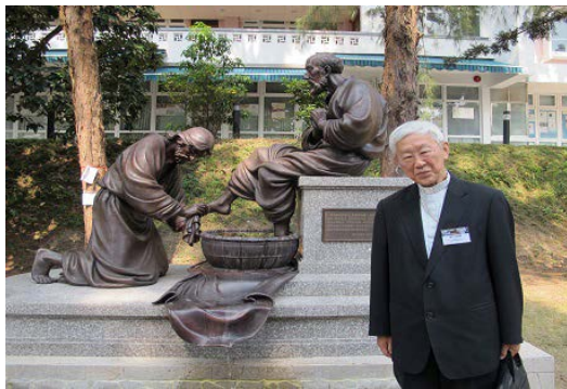
Honored for his service of companionship: Cardinal Zen.

At a ceremony in Vancouver, Canada, the Cardinal received Canada's "John Diefenbaker Defender of Human Rights and Freedom Award" for 2013. According to the Canadian Foreign Minister John Baird, who presented the award, Canada was honoring Cardinal Zen for his unwavering commitment to human rights, democracy and freedom of religion – both in Hong Kong as well as for Mainland China. On October 23, the Divinity School of the Chinese University of Hong Kong presented Cardinal Zen with its "Lifetime Companionship Award" in recognition of his decades of pastoral concern for Hong Kong's prison inmates. Since the early 1960s, the Cardinal regularly