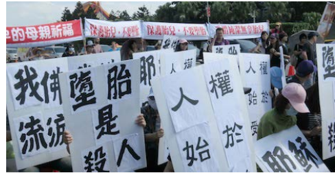
Buddhist and Christian banners protesting abortion at the demonstration of October 14.

During the demonstration, more than 1,000 Christians and Buddhists shouted “abortion is murder” and other slogans and prayed in front of the presidential office in Taipei. They also handed over to the government a petition calling for the introduction of legislation requiring mandatory counseling and a seven-day period for reflection before an abortion can be performed. The demonstration was part of the U.S.-based “Stand for Life” campaign ( UCAN Oct. 15).