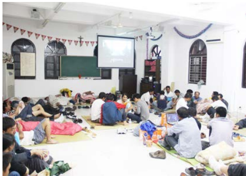
The Dongmen church in Wenzhou offered shelter to many during Typhoon Fitow.

Two churches in Wenzhou (Zhejiang Province) opened their doors to offer shelter to hundreds of people who had fled their homes during Typhoon Fitow, which raged on China's east coast. Those sheltered were mainly migrants who were provided with food and blankets. They stayed in the churches until the next morning. The parishioners took the opportunity to introduce the migrants to the activities of the Church and to show them a video on the life of Jesus.