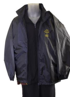
College approved Rain Jacket

Scarf – Navy with College emblem (optional)