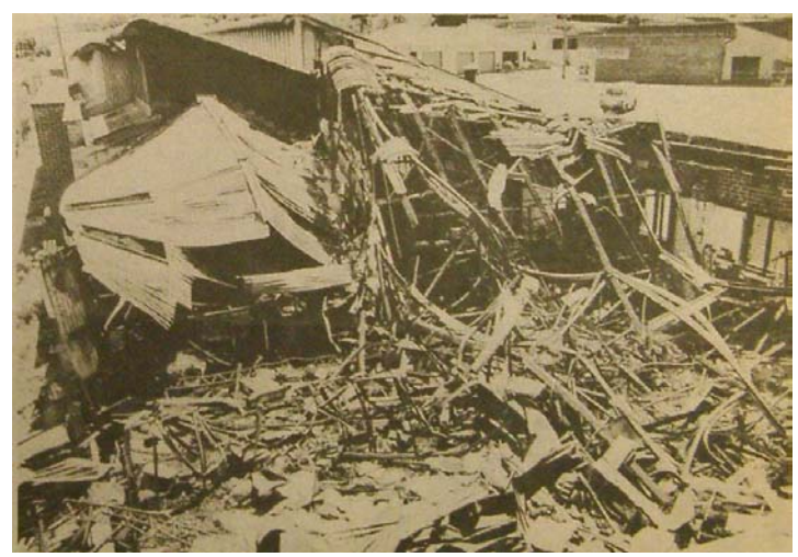
Photograph of the Albany Advertiser offices after the fire in 1981

The Albany Advertiser is today the major regional newspaper in the Albany region. The name the Albany Advertiser first appeared on 20 February 1897, as vol. 9 no. 1352, formerly the Australian Advertiser .