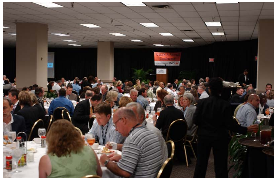
NAGDCA Opening Luncheon sponsored by ING Financial Advisers, LLC.