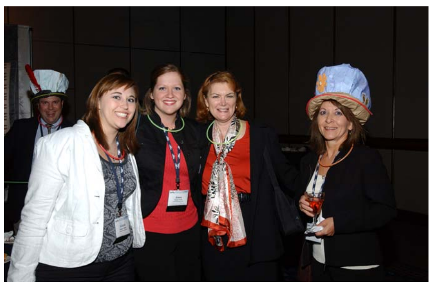
Students and NAGDCA Members mingle at the President's reception.

The students and their mentors attended a specially planned session that introduced the students to NAGDCA and its many benefits, while opening a channel of communication between the students and their mentors. Mentors were also encouraged to take some time out of their busy conference schedules and help the students network with fellow attendees, offer themselves as future resources, and provide onsite support for the students while at the conference.