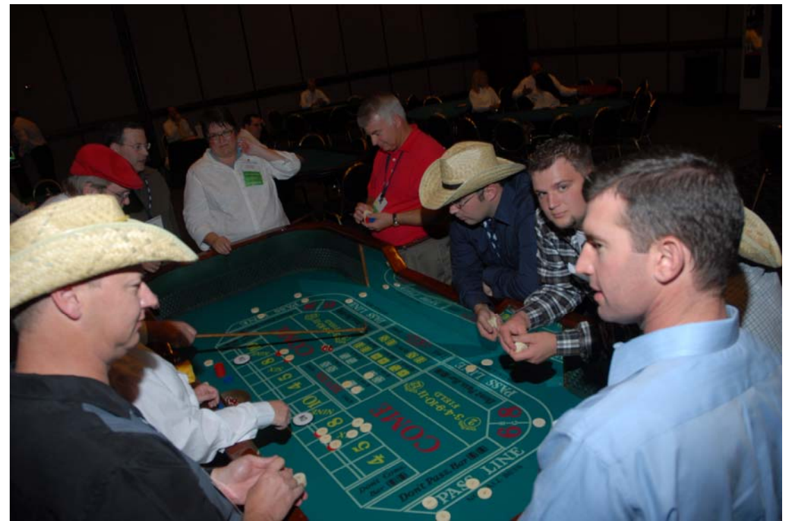
"Do we have a winner?"