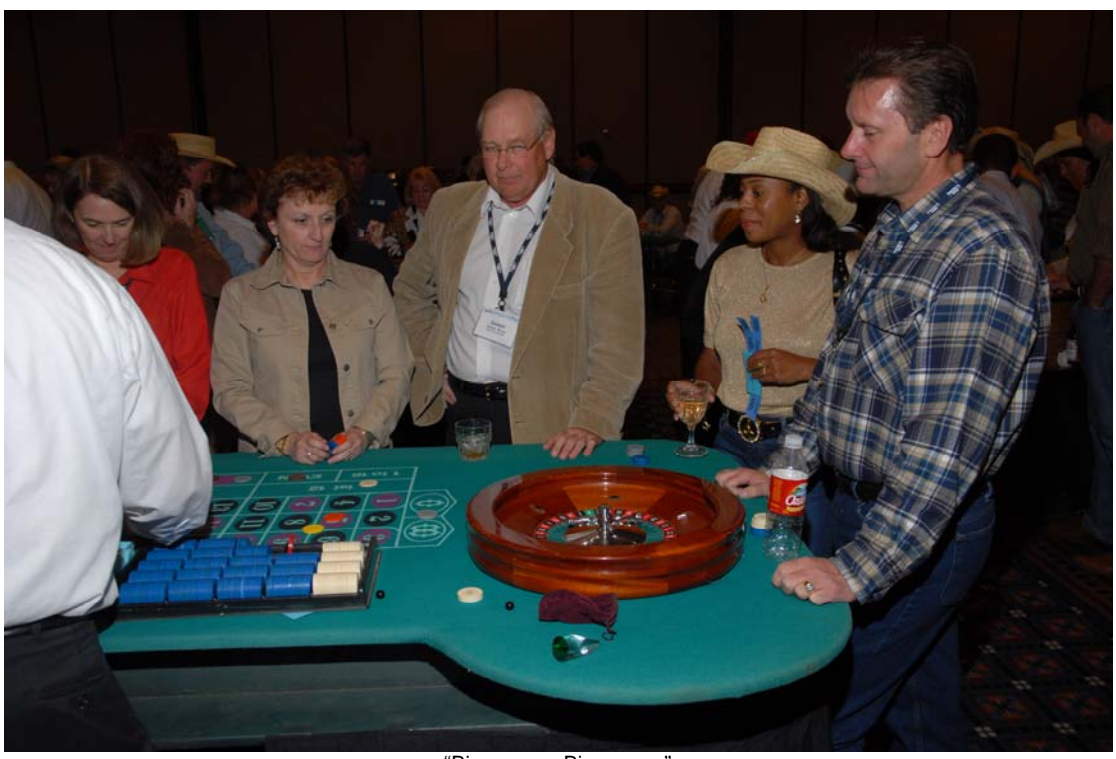
"Big money, Big money"