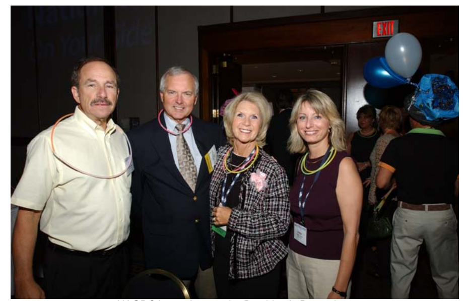
NAGDCA members at the President's Reception.