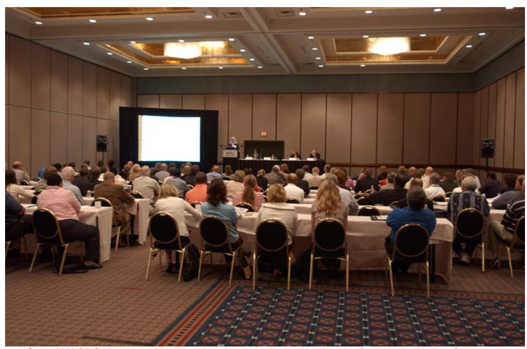
One of NAGDCA's eight educational breakout sessions: Meeting the Retiree Healthcare Challenge.