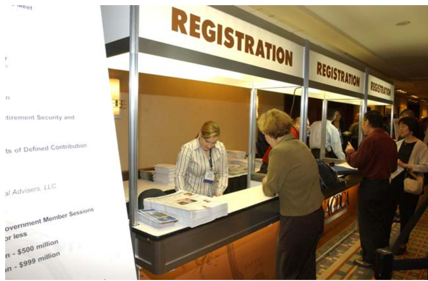
Registration for the Annual Conference kicks-off!!!

More than 55 NAGDCA members served as speakers and over 45 guests joined us for the week. Overall, the conference was a great success with delegate comments including "Excellent! Excellent! Excellent!" and "The conference gets better every year".