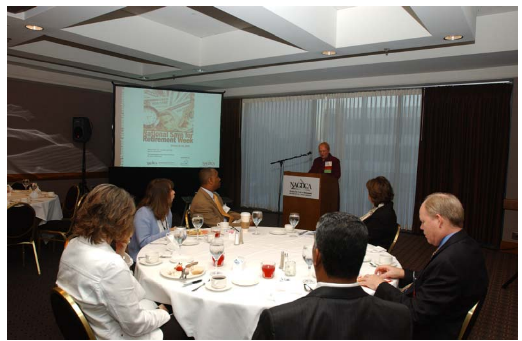
Press Breakfast announcing the National Save for Retirement Week sponsored by ICMA-RC.