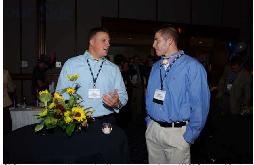
NAGDCA government member speaks with a student attending the NAGDCA Annual Conference.