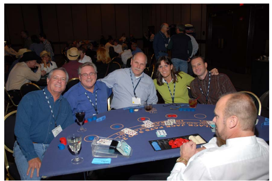
NAGDCA members enjoying the final night event.