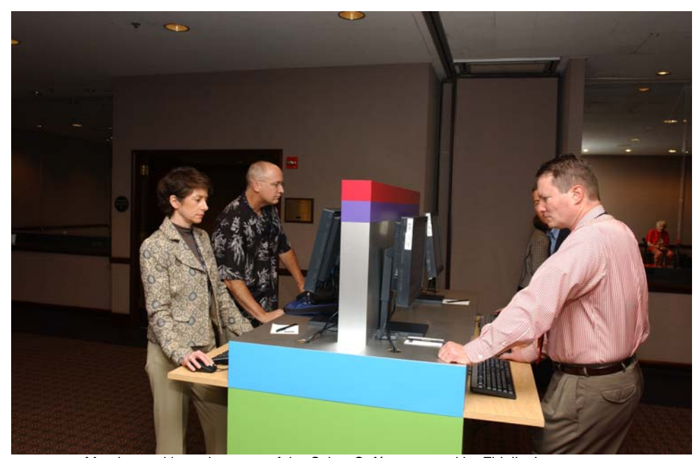
Members taking advantage of the Cyber Café sponsored by Fidelity Investments.