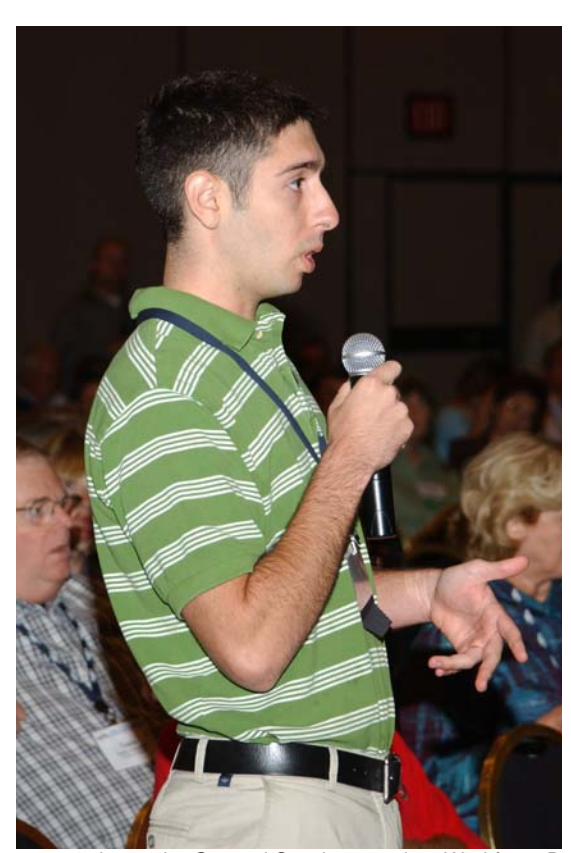
Student poses a question to the General Session panel on Workforce Demographics.

The students and their mentors attended a specially planned session that introduced the students to NAGDCA and its many benefits, while opening a channel of communication between the students and their mentors. Mentors were also encouraged to take some time out of their busy conference schedules and help the students network with fellow attendees, offer themselves as future resources, and provide onsite support for the students while at the conference.