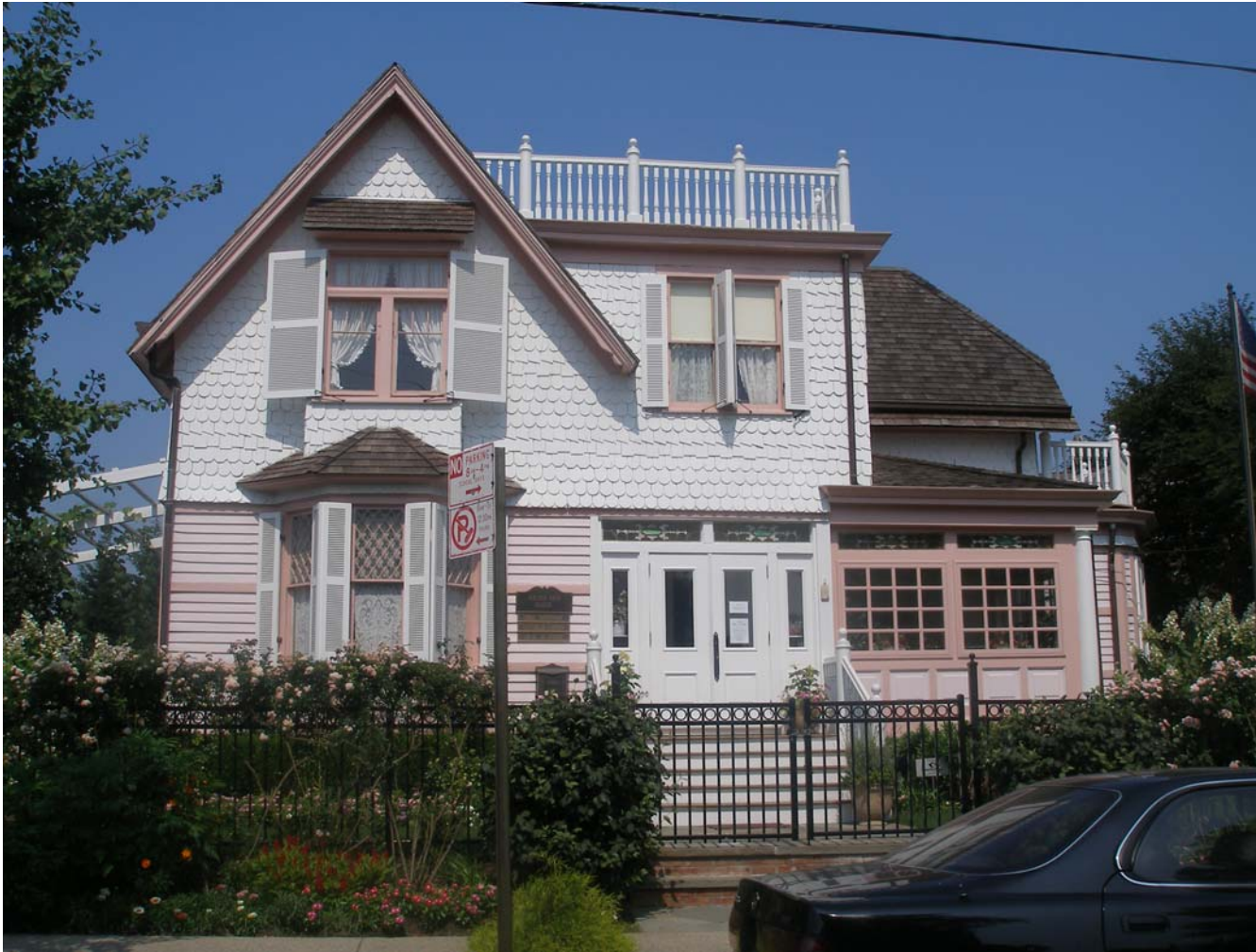
Voelker Orth Museum , Bird Sanctuary and Victorian Garden 149-19 38 th Avenue Flushing, Queens