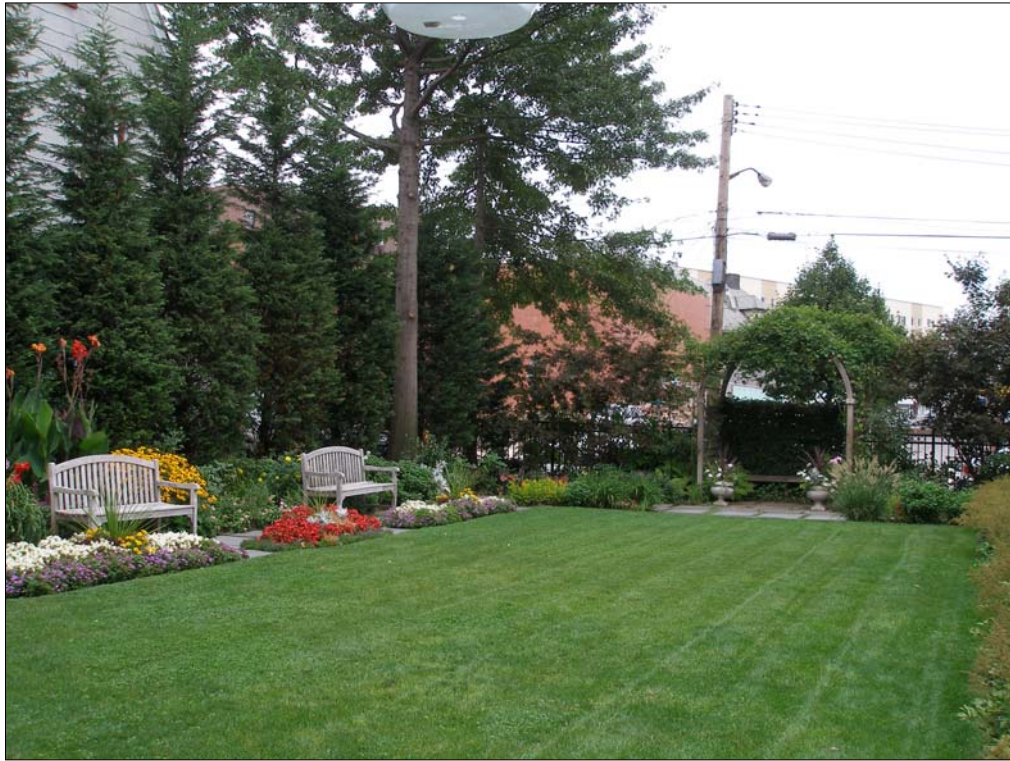
Voelker Orth Gardens