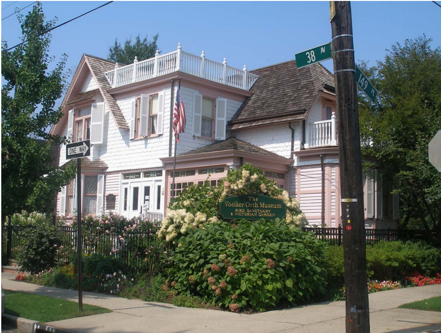
Voelker Orth Museum , Bird Sanctuary and Victorian Garden 149-19 38 th Avenue Flushing, Queens