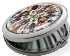
COMPACT MIRROR $29.95 (INC. GST)

This wonderfully presented book is now available at the Library Shop along with other Macquarie books and merchandise. Also available are digital archival prints of images from the exhibition. Please ask staff for details.