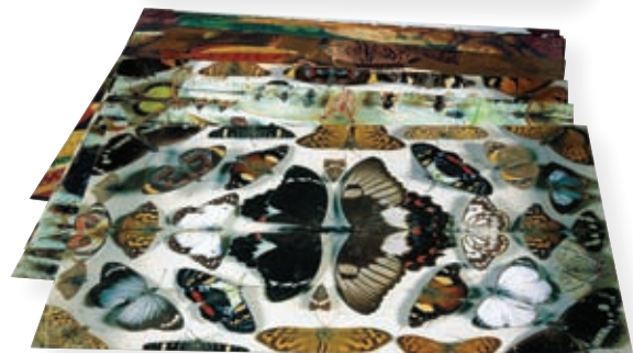
MACQUARIE COLLECTOR'S CHEST SET OF 12 POSTCARDS $14.95 (INC. GST)