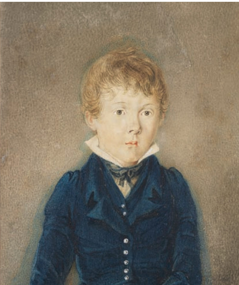
LEFT: LACHLAN MACQUARIE, C. 1819, ARTIST UNKNOWN, WATERCOLOUR ON IVORY, MIN 236