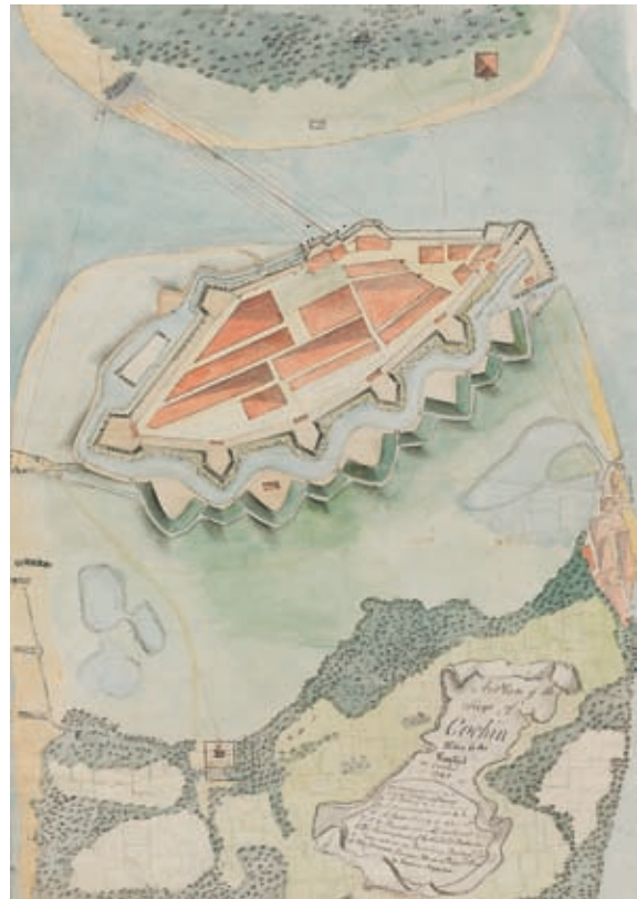
ABOVE: A PLAN OF THE SIEGE OF COCHIN TAKEN BY THE ENGLISH 20 OCTOBER 1795, C. 1795, WATERCOLOUR, M2 456.9/COCHIN/1795/1