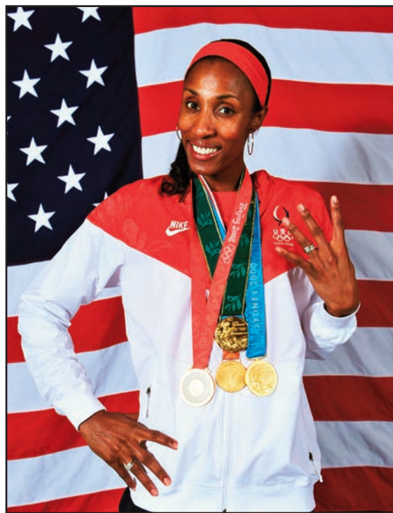
A four-time Olympic gold medalist, Lisa Leslie has led the United States to Olympic gold medals in 1996, 2000, 2004 and 2008, and aided the U.S. to FIBA World Championship gold medals in 1998 and 2002.

FIBA holds World Championships at the senior level every four years (2014, 2018, etc.). Unlike the Olympics when 12 teams participate, 24 countries compete in the World Championship for Men and 16 teams participate in the World Championship for Women. The World Championship title is considered as prestigious as the Olympic title. Sweeping double-gold in 2010, the USA men finished 9-0 to capture the gold medal at the 2010 World Championship in Turkey, while the USA women also claimed gold with a 9-0 record in World Championship play in the Czech Republic.