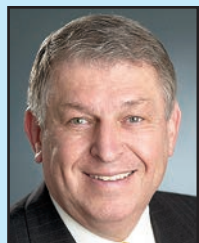
Jerry Colangelo Chairman NBA Representative JDMD Investments, LLC