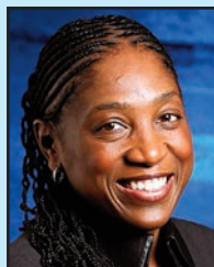
Teresa Edwards Athlete Representative 1984, 1988, 1996, 2000 Olympic Gold Medalist, 1992 Olympic Bronze Medalist