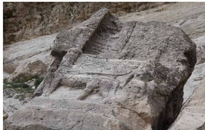
The winged Lamassu. Bullet holes can clearly be seen.