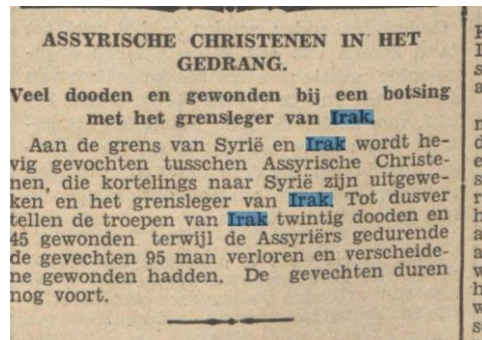
"Assyrian Christians are threatened. Many are killed and wounded in a clash with the army at border of Iraq," Nieuwsblad uit het Noorden , August 9, 1933. This border area is now called Derabon.