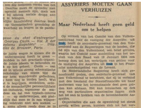
"Assyrians have to move but the Netherlands has no money to help," from De Tijd (religious-political newspaper) August 5, 1935.