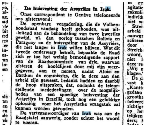
"Settlement of the Assyrians in Iraq," from Het Vaderland (state and literary newspaper), May 18, 1934