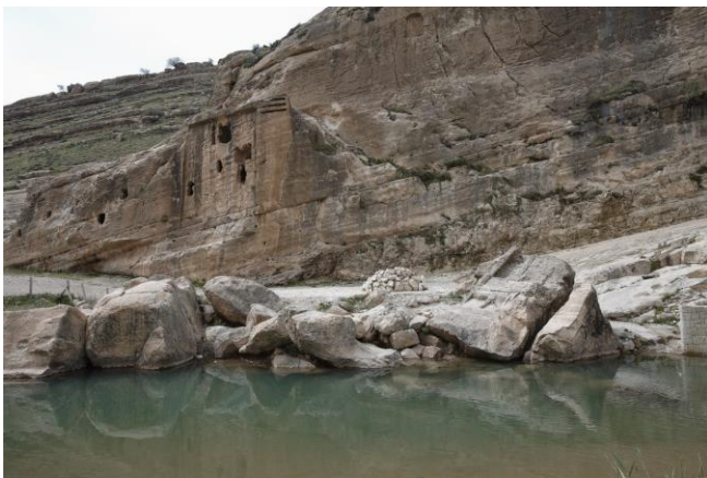
A sculpture of the Assyrian Lamassu, a winged bull, lies neglected on the riverbank after being blown up

Another example of changing the culture in northern Iraq to a Kurdish one is an archaeological site near Khinis (also called the Gomel Gorge). This cultural heritage site was built around 700 BC by the Assyrian king Sennacherib. On the cliff-faces are reliefs, inscriptions and sculptures which date from that era. A few years ago the ruins were blown up. Observers have indicated that Kurdish militias regularly used to practice their shooting on this important cultural heritage site. 7