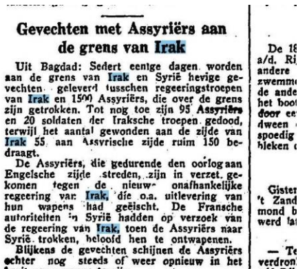
"Fights with Assyrians at the border of Iraq," in Het Vaderland (state and literary newspaper), August 9, 1933.