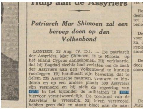
"Help for the Assyrians: Patriarch Mar Shimoen will appeal to the League of Nations," De Tijd (religious-political newspaper), August 22, 1933. This patriarch's uncle and predecessor was killed by Simko Aga Shikaki. This murder is not recognized by Kurdish political leaders, since Kurds perceive Simko Aga as a hero.