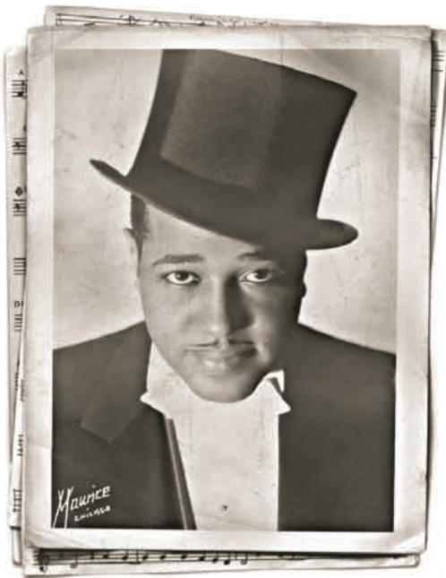
A piano player. A composer. An orchestra leader. Duke Ellington reigned over a land called Jazz.

His music spread across the world with songs like "Sophisticated Lady," "In a