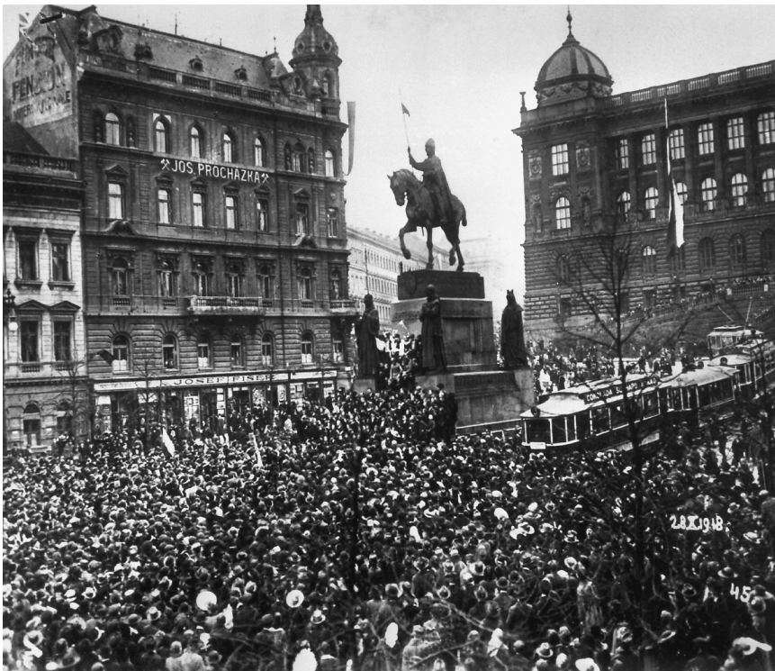
Crowds flood Prague's Wenceslas Square on October 28, 1918.

While the negotiators in Geneva were approving the exiles' actions abroad and creating a government, in Prague the local Austro-Hungarian military command was surrendering authority to the National Committee. On October 31 the Geneva talks agreed on a democratic Czechoslovak republic with Masaryk as president, Kramář as prime minister,