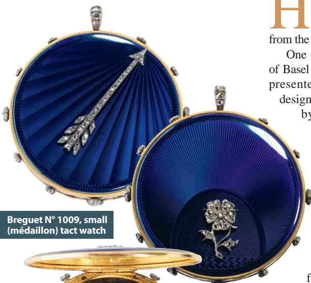
Breguet N° 1009, small (médaillon) tact watch

A blue-enameled gold case and a diamond-set pointer and studs speak of the watch's noble origin. The 43mm-diameter tact watch, equipped with a silver dial and a ruby cylinder escapement, was sold to the ambassador from Naples in 1802.