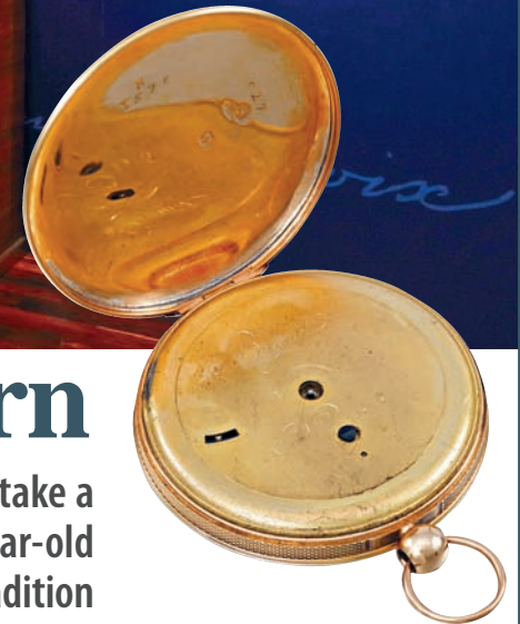
Breguet N° 1576, montre de souscription