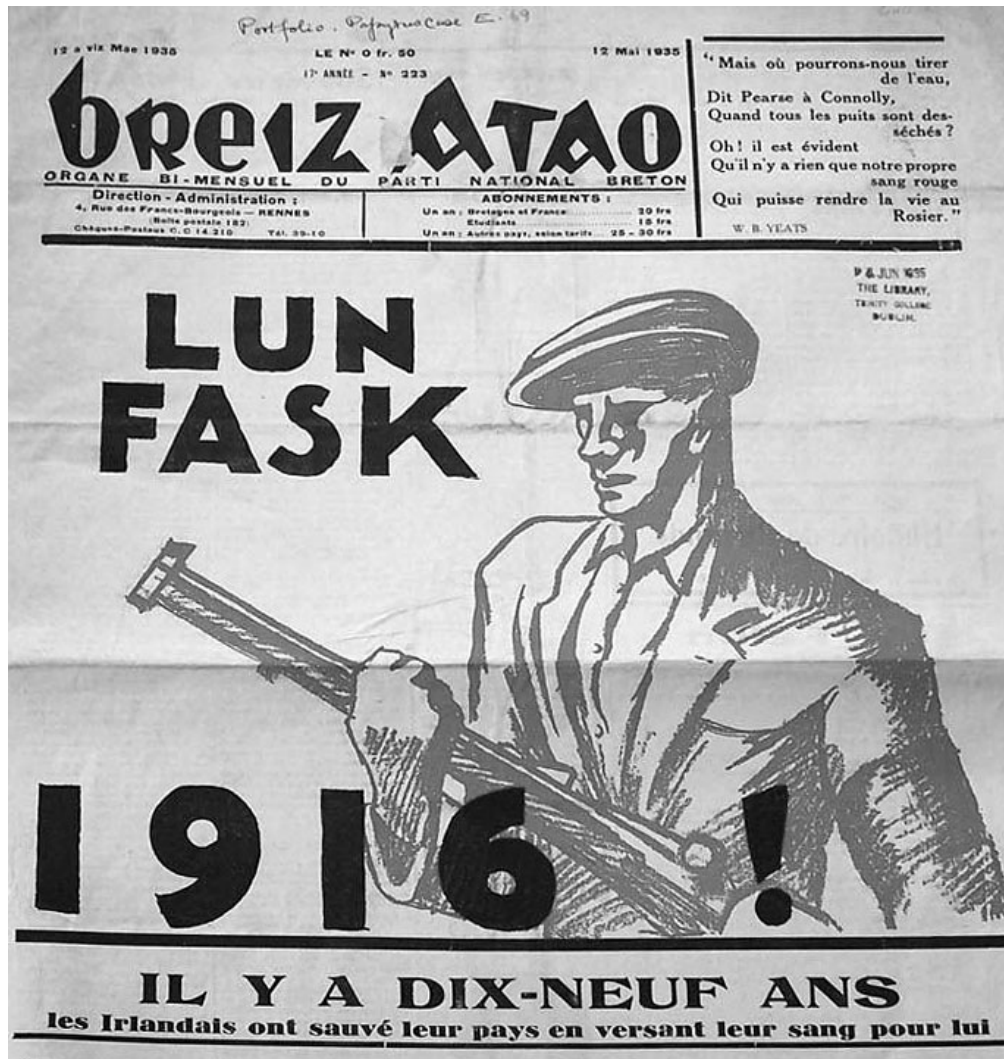
Figure 2. Easter Rising commemorative issue of Breiz Atao (Brittany Forever), May 1935. "Easter Monday 1916! Nineteen years ago, the Irish saved their country by shedding their blood for it."

Whatever their inspiration, notions of enduring Breton military heritage allied to whatever power opposed Paris were particularly inspirational for Lainé and the militants of the Bezen Perrot :