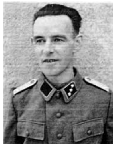
Figure 6. SS-Untersturmführer Célestin Lainé, ID photo, early 1945. (" Bezen Perrot archives" [previously unpublished]).

Rumours at this time were rife that separatists were conducting guerrilla campaigns against the forces of