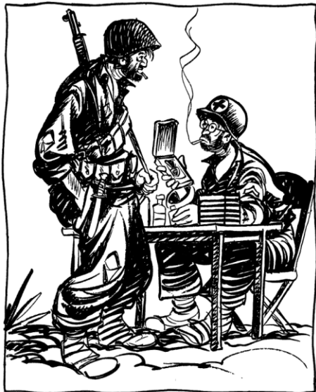
Just gimme a couple aspirin. I already have a purple heart." (Bill Mauldin 1921-2003)

Wind & Stars Productions is making a documentary about the life of Bill Mauldin. No one on the homefront had ever seen cartoons like these. Bill Mauldin was more than a cartoonist. With WWII censorship guaranteed a sanitized flow of images in which our fighting men were always brave and morale high. But Mauldin's cartoons showed a different war, penned by a 22-year-old infantry sergeant who lived on the frontlines to capture the fighting grunt's perspective. Ernie Pyle called Bill Mauldin "the finest cartoonist the war has produced...not merely because his cartoons are funny, but because they are also terribly grim and real." Mauldin's 700 wartime cartoons stand as masterpieces of WWII. One young machine-gunner named Charles M. Schulz ranked Mauldin as "The Greatest Cartoonist Who Ever Was". Wind & Stars will capture B Roll at Arlington National Cemetery to be included in this documentary film. (Supports 'Broaden Understanding and Advocacy')