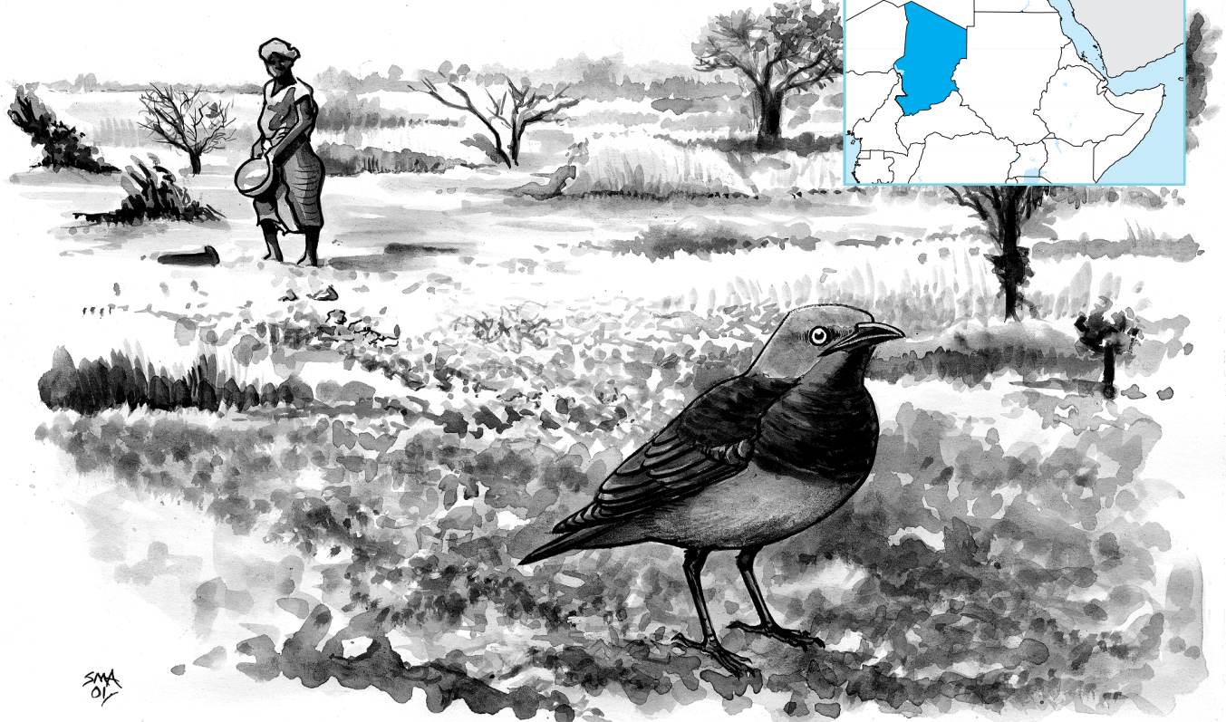
Chestnut-bellied Starling Lamprotornis pulcher.