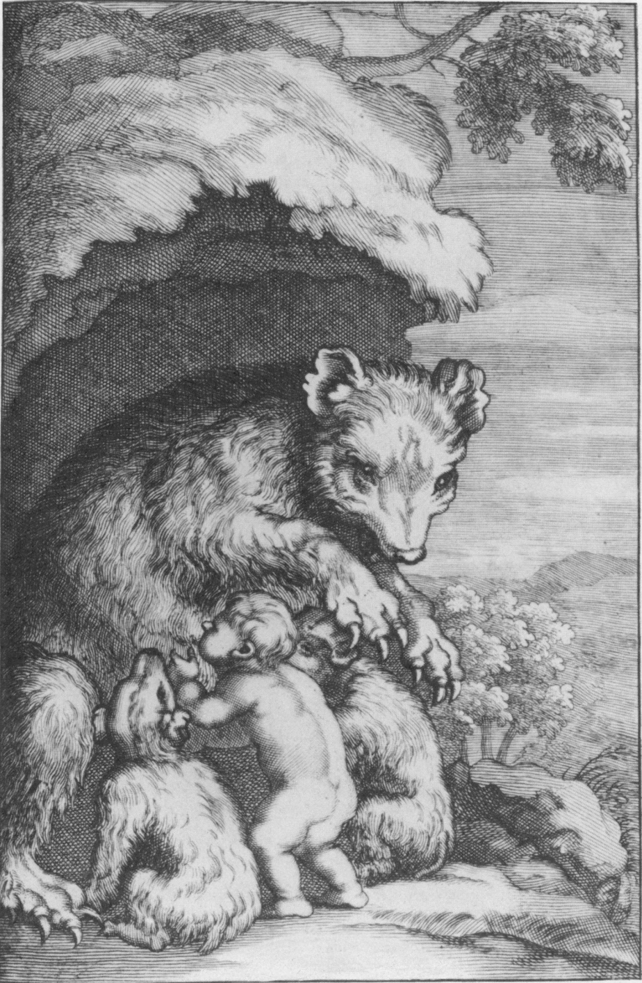
FIGURE 1: A bear suckling a child, from Bernard Connor, The History of Poland (London, 1697), 1: 342.