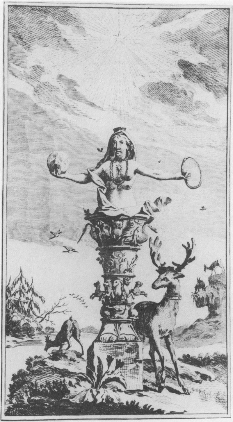
FIGURE 3: Frontispiece to Linnaeus's Fauna Svecica (1746), featuring a many-breasted Diana. Linnaeus's Diana is relatively modest with only four breasts; earlier depictions often featured twenty-eight or more breasts, sometimes encircling her entire upper body. Diana's breasts, spouting water, also became a favorite motif for fountains (those at Villa d'Este, Tivoli, for example).