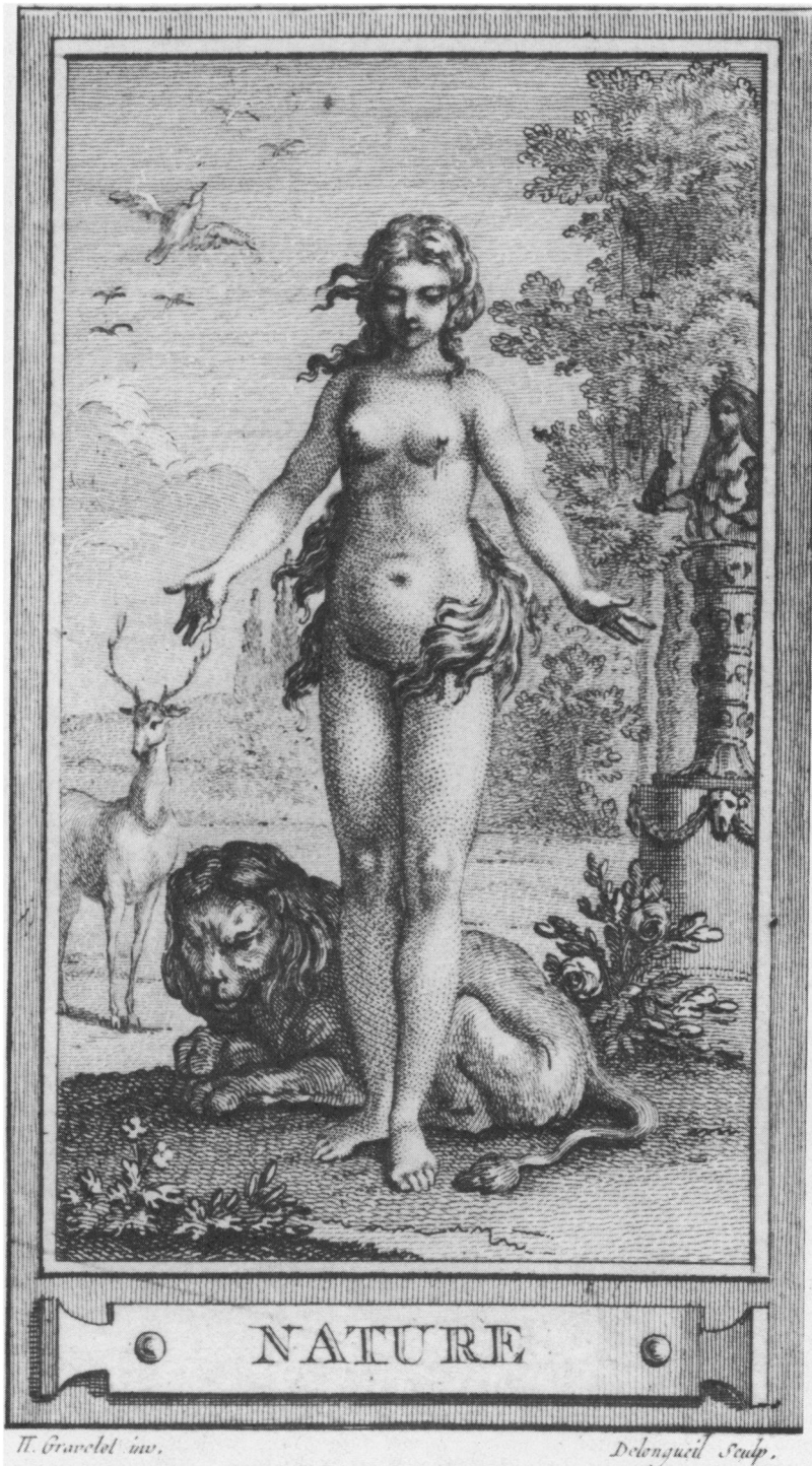
FIGURE 2: Nature portrayed as a young virgin. Though a virgin, her breasts are shown dripping with mother's milk (the virgin mother is a persistent theme in Christianity, where the ideal female is both chaste and fecund). Nature's nudity expresses the simplicity of her essence. The lion and stag are symbols of chastity. The multi-breasted Diana of the Ephesians in the background represents the ancients' image of nature, "the Mother of all Being." From Charles Cochin and Hubert François Gravelot, Iconologie par figures; ou, Traité complet des allégories, emblèmes &c (1791; rpt. edn., Geneva, 1972), s.v. "Nature."