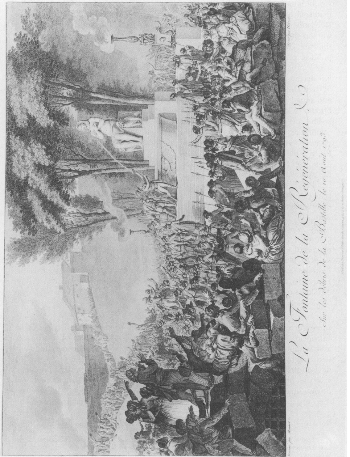
FIGURE 6: The "Fountain of Regeneration" by Jacques-Louis David, the famous eighteenth-century French painter. From Charles Monnet, Les principales journées de la révolution (Paris, 1838). Spencer Collection, The New York Public Library, Astor, Lenox, and Tilden Foundations.