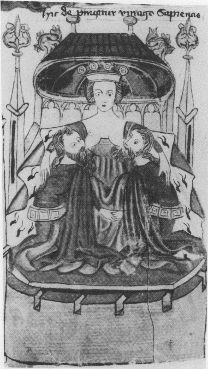
FIGURE 4: Sapientia (the personification of wisdom) suckling two philosophers. From a fifteenth-century German manuscript, reproduced in Lieselotte Möller, "Nährmutter Weisheit," Deutsche Vierteljahrsschrift , 24 (1950), fig. 2, facing 351.