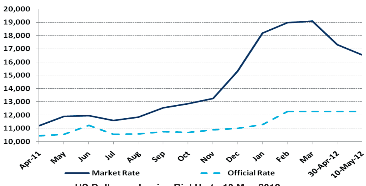
US Dollar vs. Iranian Rial Up to 10 May 2012

According to Iran's Geology Organization Exploration Affairs, three new gold mines with a total of 16 tonnes of proven reserves and an estimated total value of $850 million have been discovered in the city of Saggez in North Western Iran. With the new discovery, Iran's gold reserves will increase to 320 tonnes. Iran ranks 22nd in terms of gold and foreign currency reserves based on data released by the Central Intelligence Agency (CIA). The Tehran Chamber of Commerce, Industries and Mines recently stated that Iran's gold reserves have reached a new record at nearly $17.5 billion.