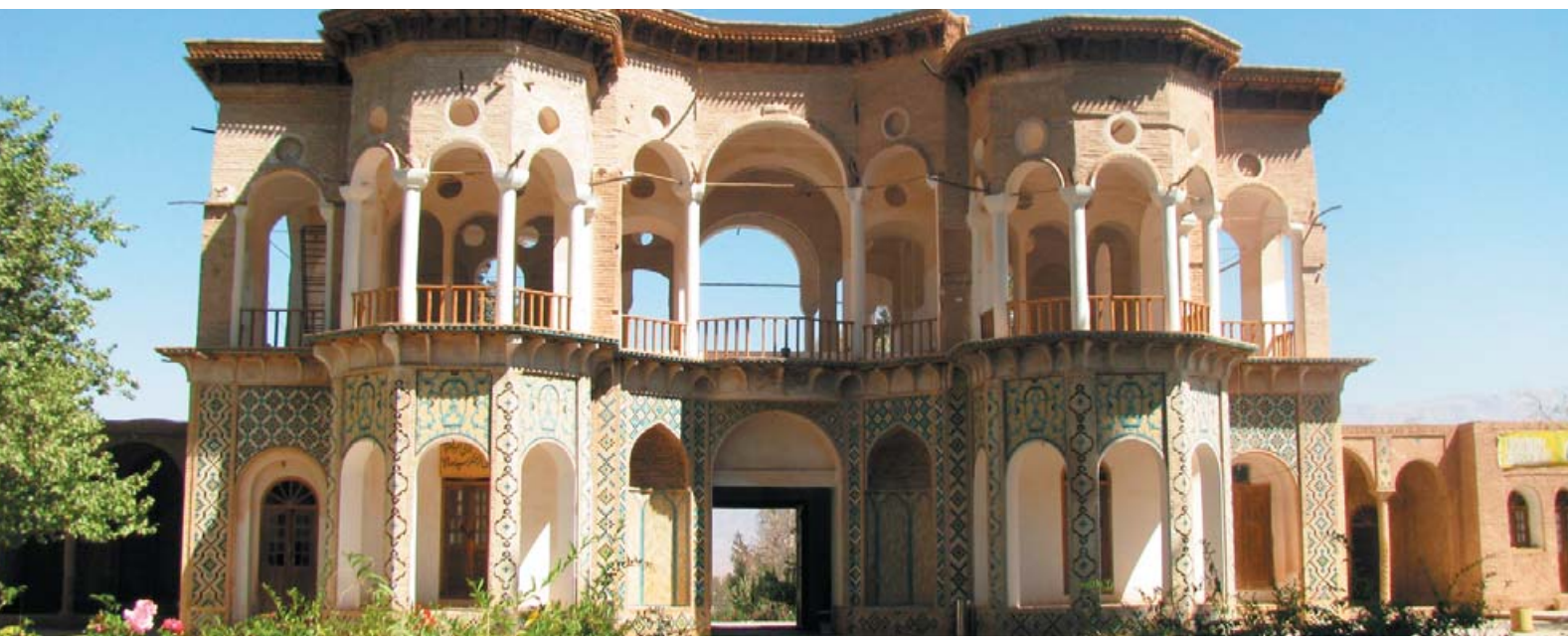
UNESCO Registered Mansion in Shahzadeh Mahan Garden, Ancient City of Kerman, South East of Iran