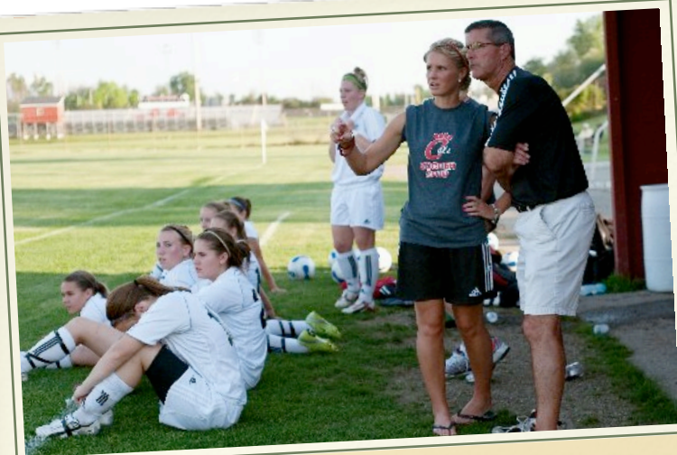
SOCCER JARGON MSYSA