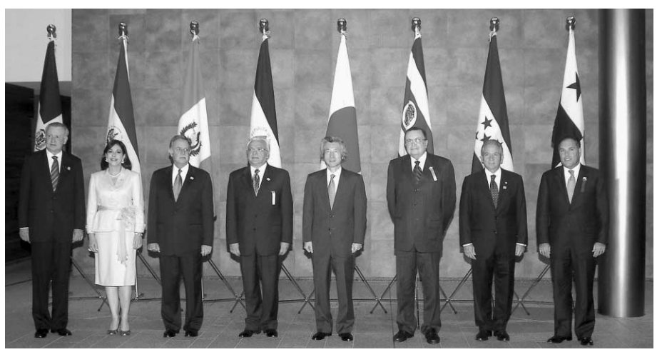
Leaders in attendance at the Japan-Central America Summit Meeting (August 18, Prime Minister's Office;)