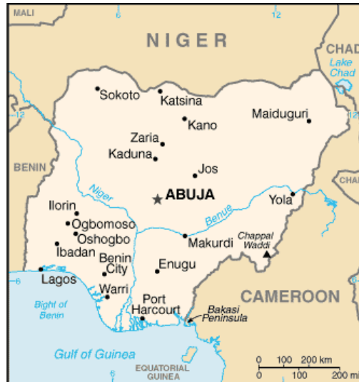
Map of Nigeria

In the most recent study, Martin and Stiles (2000) argued that ivory sales in Lagos had "increased in the 1990s, perhaps back to the late 1980s level". In fact, Nigeria was the only country amongst the eight West and Central African countries surveyed to exhibit such a trend (Martin and Stiles, 2000). They further noted the presence of carvers from Guinea, Mali, Gabon and the Democratic Republic of the Congo in Nigeria, as well as native Nigerians themselves in the trade (Martin and Stiles, 2000). The current study is an attempt to update the situation further and track the ivory trade situation in Nigeria some three years later.