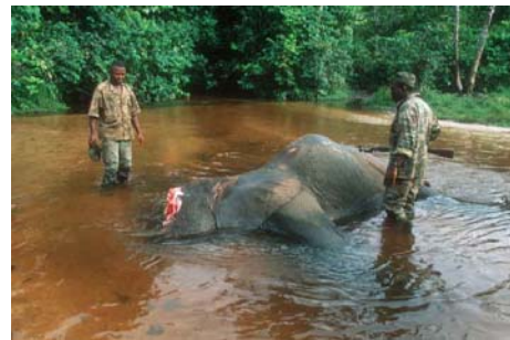
African Forest Elephant killed by poachers being inspected by game guards. Dzanga-Ndoki National Park, Central African Republic