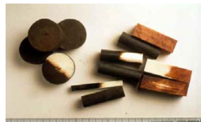
Ivory seals and disks (painted to look like wood)

Although at greatly reduced levels from what was observed in 1999 (Martin and Stiles, 2000), most of the buyers of worked ivory are tourists, expatriates, Senegalese traders, diplomats from Asian countries, and some local African businessmen, according to the vendors interviewed. In contrast to the previous study, curiously, Americans were frequently cited as the main tourists buying ivory, even more