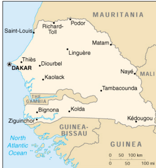
Map of Senegal

Field research was carried out in Senegal from the 21 st -30 th June 2002, with a series of visits to retail outlets and workshops in Dakar, Saly and Mbour to observe the availability of ivory on the local market and to assess a variety of factors associated with the trade. The field study was complemented by a series of meetings with relevant government authorities, representatives of conservation organisations and individual experts in Senegal. Assistance in organising certain meetings was provided by the office of the World Wide Fund for Nature (WWF) in Dakar. These meetings were designed to assess national legislation and policy concerning trade in ivory and, later, to supplement or confirm information collected during the market survey itself. The following eleven individuals were interviewed: