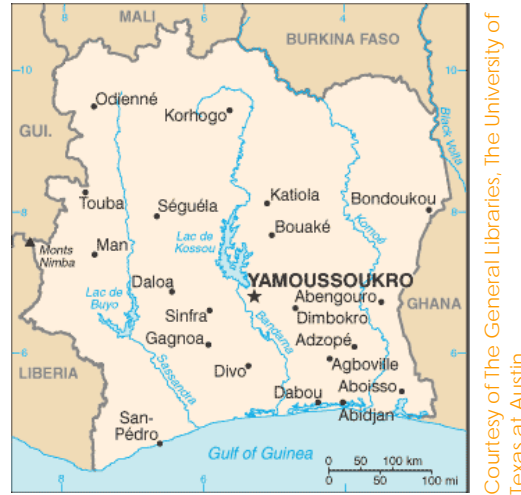
Map of Côte d'Ivoire

The large-scale conversion of forest to cultivated land, a process that commenced at the turn of the 20 th century and continues through to the present, has resulted in a profound fragmentation of Côte d'Ivoire's population of African Elephants. Now believed to occur in some 24 separate locations in the country, the status of the species is poorly known as there has been very little survey work in recent years (Barnes et al. , 1999; Blanc et al. , 2003). According to the most recent estimates using the IUCN African Elephant Database population data categories, Côte d'Ivoire has a very small elephant population, with only 63 in the 'Definite' category, another 360 considered 'Possible' and a further 666 in the 'Speculative' category (Blanc et al. , 2003). Although most elephants occur in protected areas, many small and isolated populations are probably not viable in the long term, particularly if their sex ratios have become skewed from the effects of poaching for ivory (Blanc et al. , 2003). In some locations, crop raiding provokes considerable ongoing human/elephant conflict.