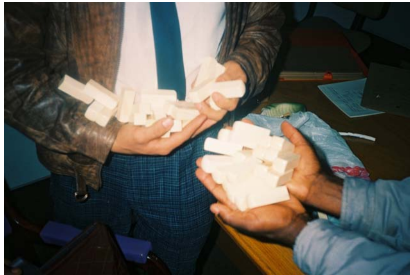
Confiscated ivory name seal blanks