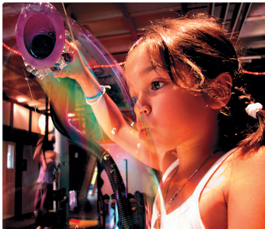
Wonder and curiosity – beginning a future inventor's career.

Published by the Swedish Institute January 2007 FS 91 e